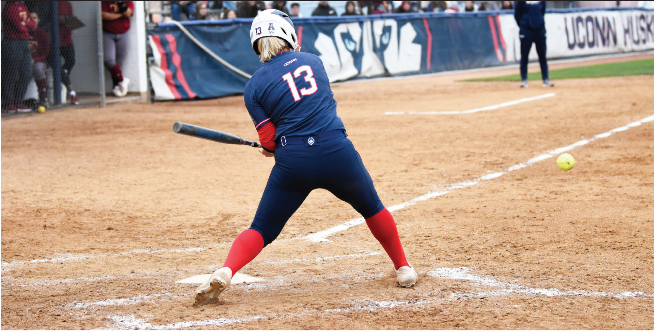
In this Oct. 6, 2019 file photo, a UConn softball player takes a swing at the ball during a game against Boston College. The Huskies lost the game 8-7.