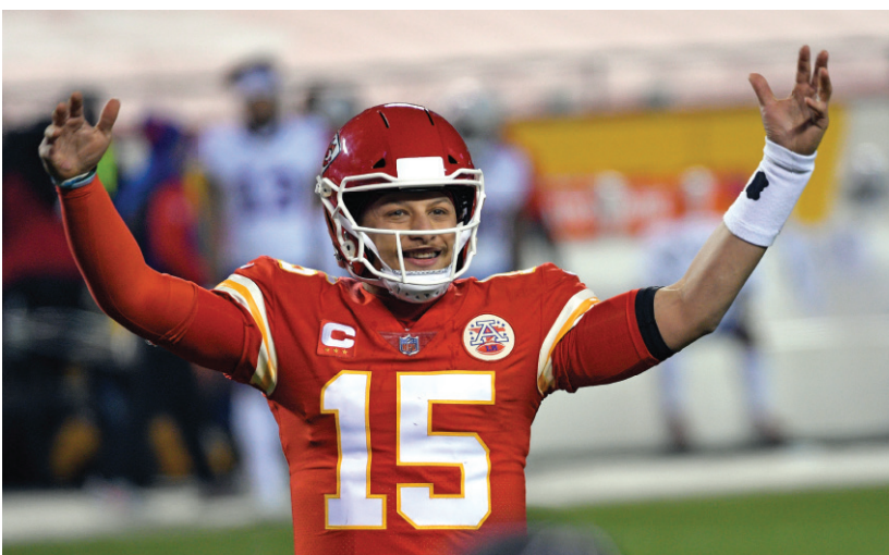
Kansas City Chiefs quarterback Patrick Mahomes celebrates at the end of the AFC championship game against the Buffalo Bills, Sunday, Jan. 24, 2021, in Kansas City, Missouri. The Chiefs won 38-24.