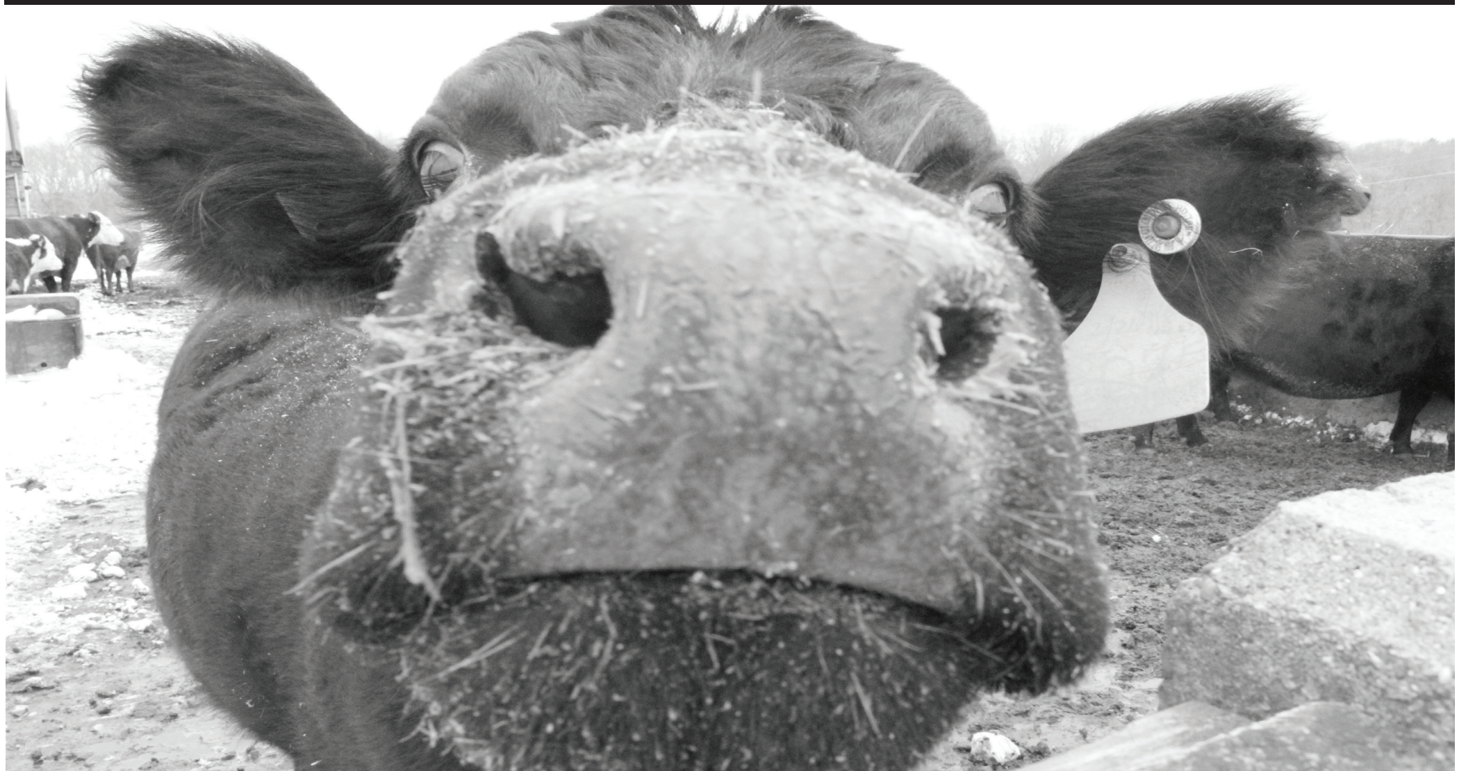
A cow at Horsebarn Hill gets a closer look at a photographer's camera.