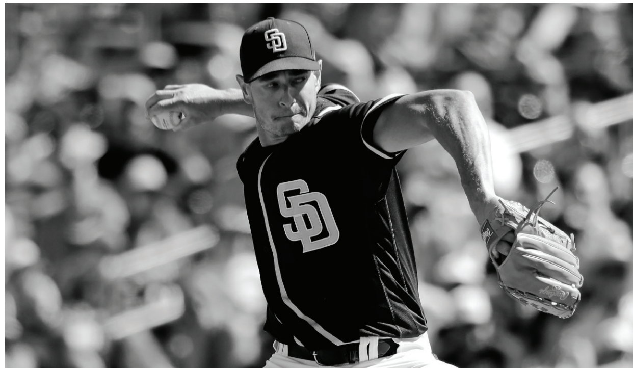
San Diego Padres starting pitcher Garrett Richards throws against the Los Angeles Dodgers during a spring training baseball game in Peoria, Arizona, in this Monday, March 9, 2020, photo. Right-hander Garrett Richards and the Boston Red Sox finalized a $10 million, one-year contract on Wednesday, Feb. 3, 2021.

BOSTON (AP) — After spending the first decade of his career on the West Coast, Garrett Richards was eager to give Boston a try.