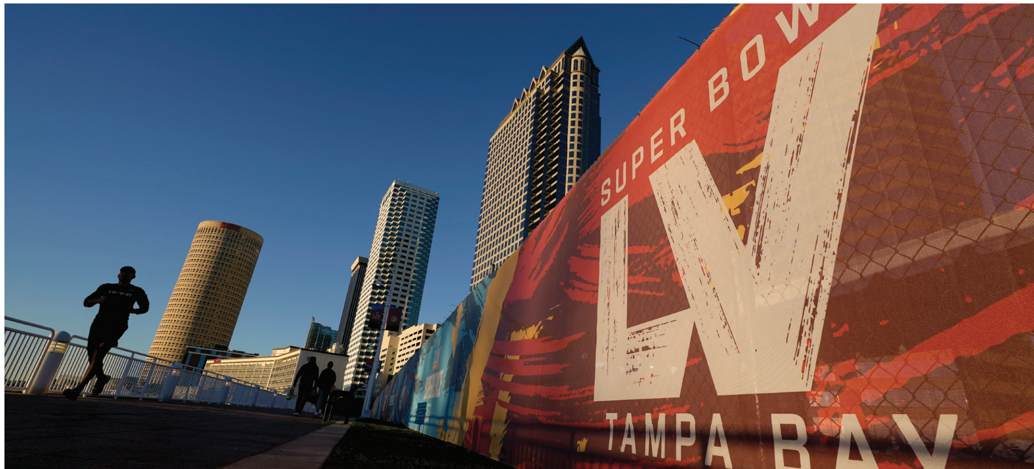
A man passes signage for Super Bowl 55 as he runs along the Hillsborough River on Wednesday, Feb. 3, 2021, in Tampa, Fla. The city is hosting Sunday's Super Bowl football game between the Tampa Bay Buccaneers and the Kansas City Chiefs.

by DC Sports Section sports@dailycampus.com