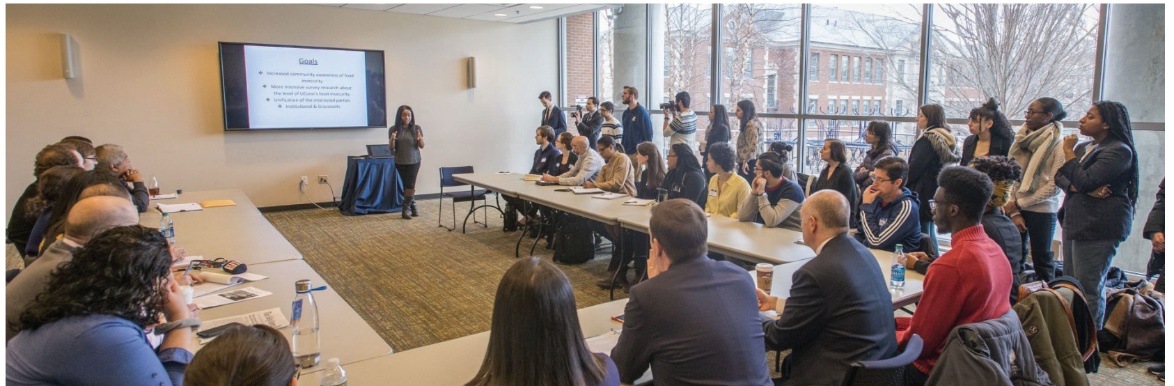
The University of Connecticut Undergraduate Student Government conducts a meeting regarding food insecurities. USG held an emergency meeting Wednesday night reverting the veto on a statement denouncing the Capitol riot and white supremacy.