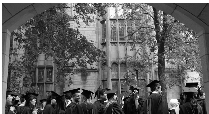
Future graduates wait for the procession to begin for commencement at Yale University in New Haven, Conn. The Biden Justice Department said it is dismissing its discrimination lawsuit against Yale University on Wednesday, Feb. 3rd.

Yale said its practices comply with decades of Supreme Court precedent and that it looks at