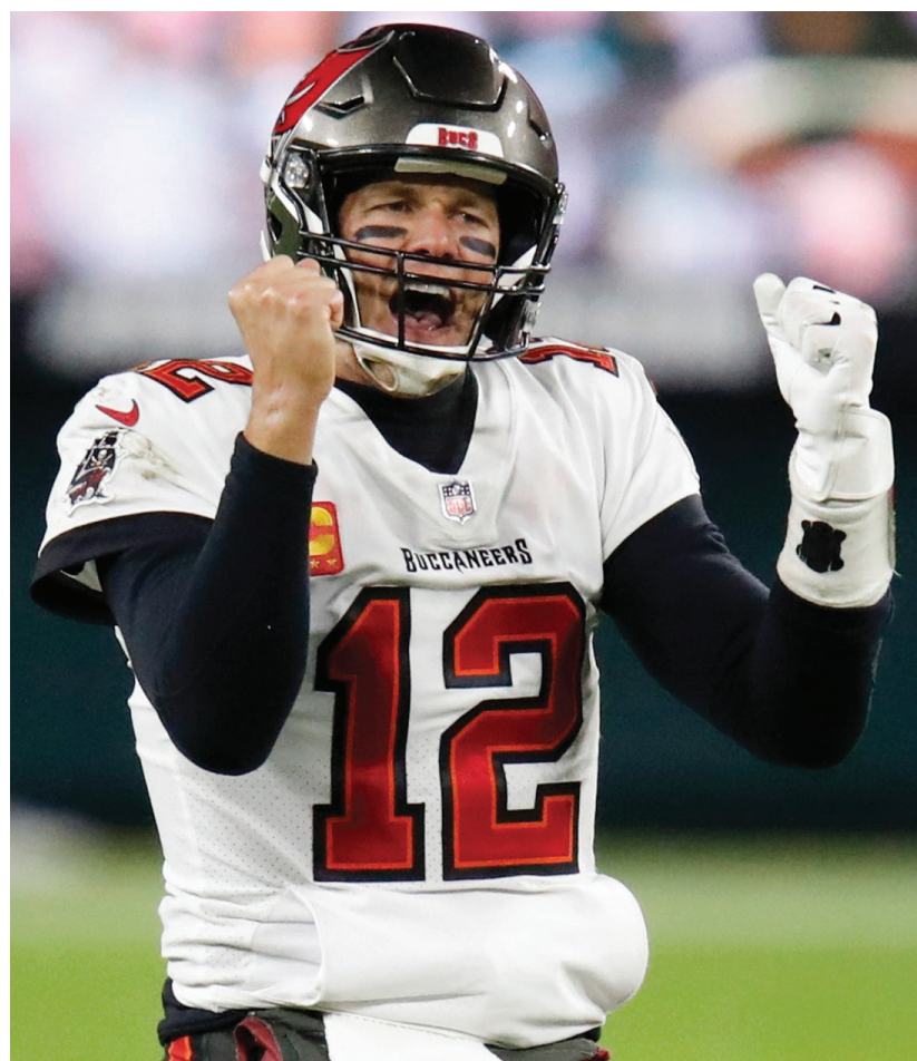
In this Sunday, Jan. 24, 2021, photo, Tampa Bay Buccaneers quarterback Tom Brady reacts after winning the NFC championship game against the Green Bay Packers in Green Bay, Wisconsin. The Super Bowl matchup features the most accomplished quarterback ever to play the game who is still thriving at age 43 in Brady against the young gun who is rewriting record books at age 25.