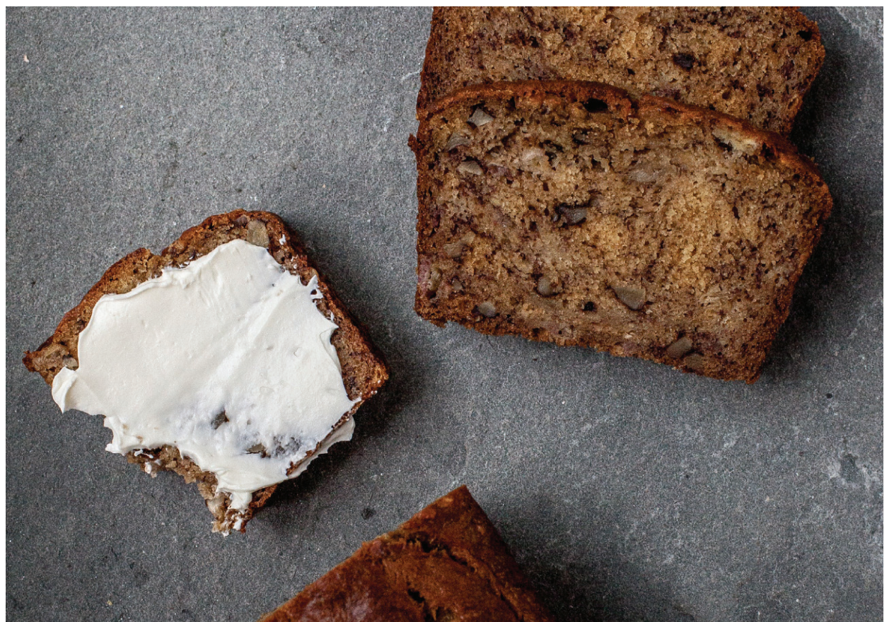
Banana bread snow day inspiration. Author Hollie Lao wrote about how to take advantage of a snow day with warm and delicious snacks.

Whip up a bowl of pancake mix (either store-bought, like Bisquick, or from scratch, like this recipe from Cafe Delites) and get creative. There's the classic addition of fruits, like blueberries or bananas, or sweet ingredients, like chocolate chips. If you want to step it up a notch, you can try flavor combinations like pumpkin spice, apple pie, Oreo, cinnamon pecan, mocha, peanut butter and banana, dulce de leche and more! These would taste great with a variety of toppings: