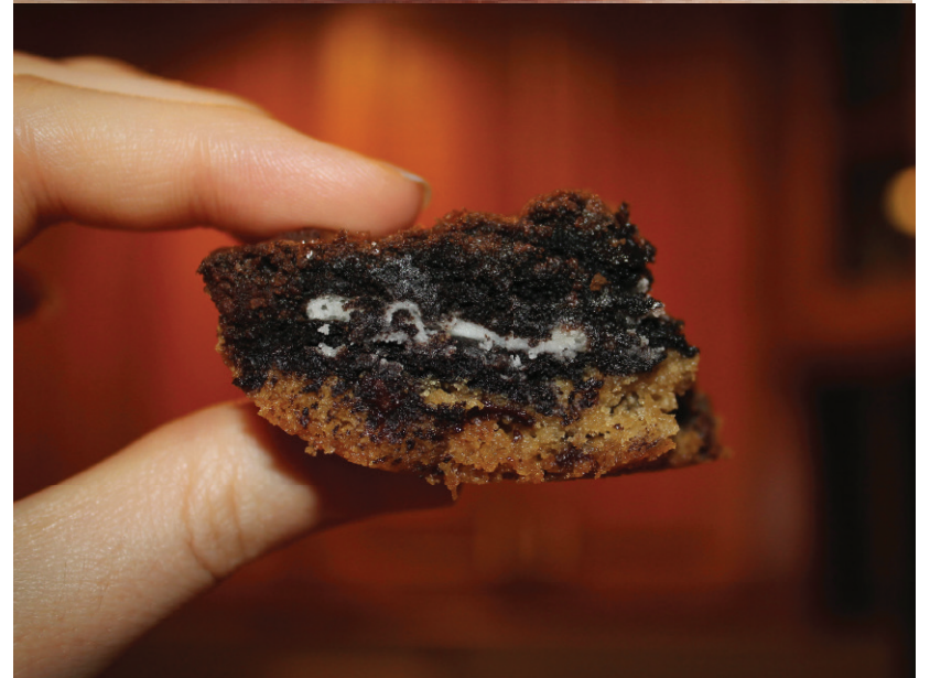
Nacho Roll-Ups and Slutty Brownies are some Super-Bowl snacking favorites.