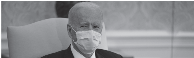
President Joe Biden looking at the camera. On Feb. 3, he met up with other major Democrats to discuss the coronavirus relief package.