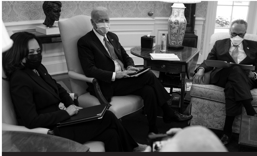
Sen. Patrick Leahy, D-Vt., takes a photo of, from left, Vice President Kamala Harris, President Joe Biden and Senate Majority Leader Sen. Chuck Schumer of N.Y. during a meeting to discuss a coronavirus relief package in the Oval Office of the White House, Wednesday, Feb. 3, 2021, in Washington.