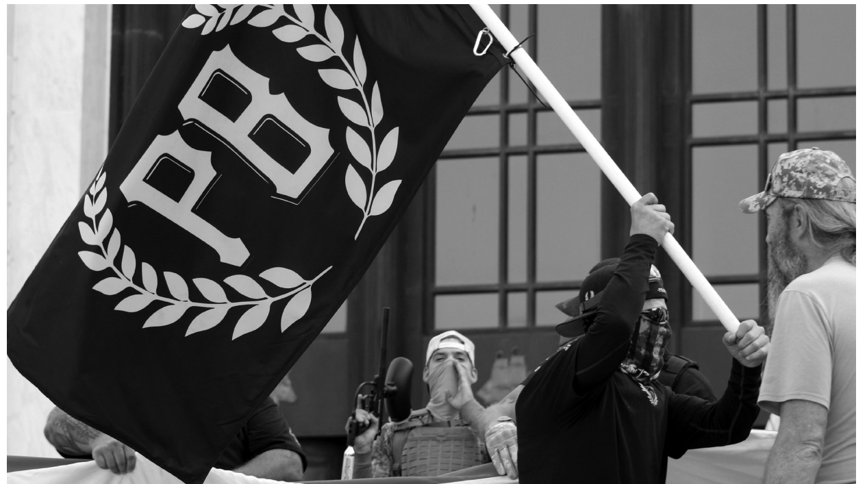
A protester carries a Proud Boys banner, a right-wing group, while other members start to unfurl a large U.S. flag in front of the Oregon State Capitol in Salem, Ore. The Canadian government designated the Proud Boys group as a terrorist entity on Wednesday, Feb. 3, 2021, noting they played a pivotal role in the insurrection at the U.S. Capitol on Jan. 6.