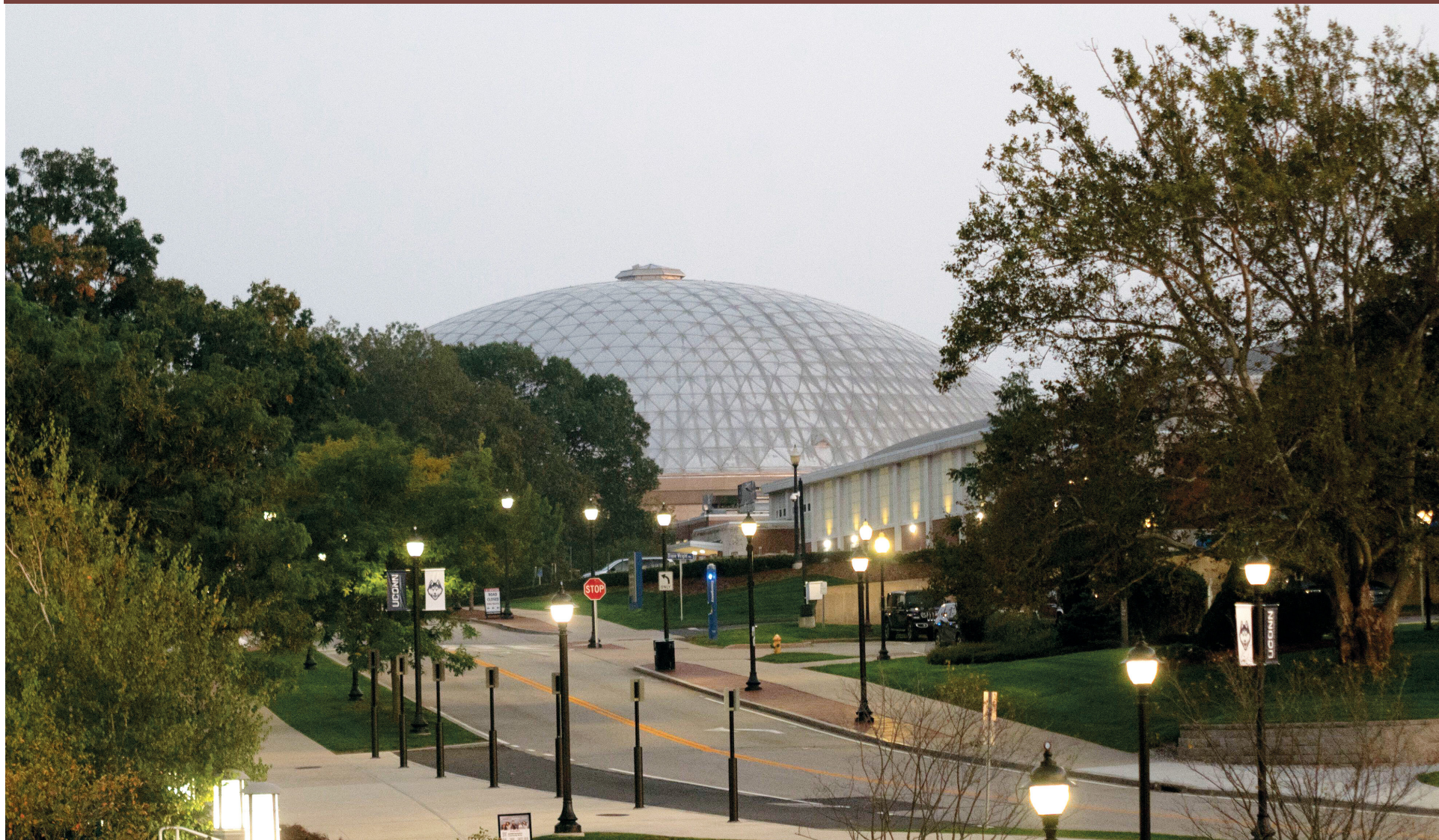
UConn's Storrs campus becomes a quiet campus as students await Super Bowl LVIII. Will it be a back to back win for Kansas City or a Cinderella story for "Mr. Irrelevant" Brody Prudy's 49ers?