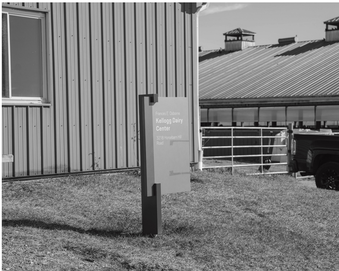
Photos of the Kellogg's dairy center that was built in 1991. The KDC houses the Department of Animal Science's milking cows in its nationally recognized dairy herd.