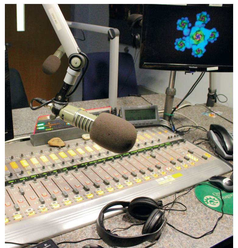
A photo of the WHUS radio station. It is home to UConn's Alternative radio station and hosts podcasts and sports talks as well.