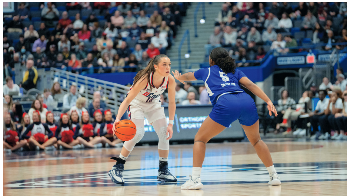
UConn womens basketball took on Seton Hall at the XL Center on Wednesday Feb. 7. The Huskies won the game 67-34.

They'll have the final six games of the Big East and the BET as a chance to get right, but it's difficult to imagine what they would have done differently on Sunday. Their next challenge comes at Xavier, who is 0-12 in conference.