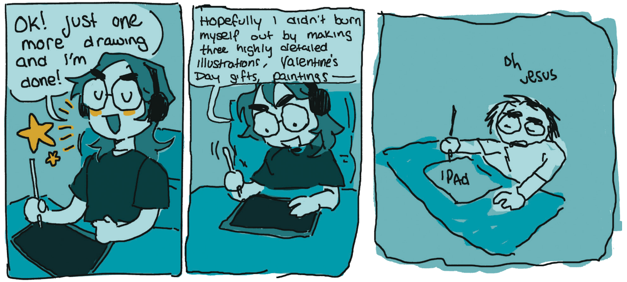
CARTOON BY HALEIGH SCHMIDT, ASSOCIATE ARTIST EDITOR/THE DAILY CAMPUS

Disclaimer: The views and opinions expressed by individual writers in the opinion section do not reflect the views and opinions of The Daily Campus or other staff members. Only articles labeled "Editorial" are the official opinions of The Daily Campus.