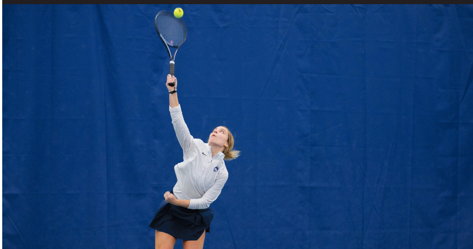
UConn wins against Quinnipiac on Wednesday Feb. 7th in Manchester. The final score was five-to-four across all the matches played.