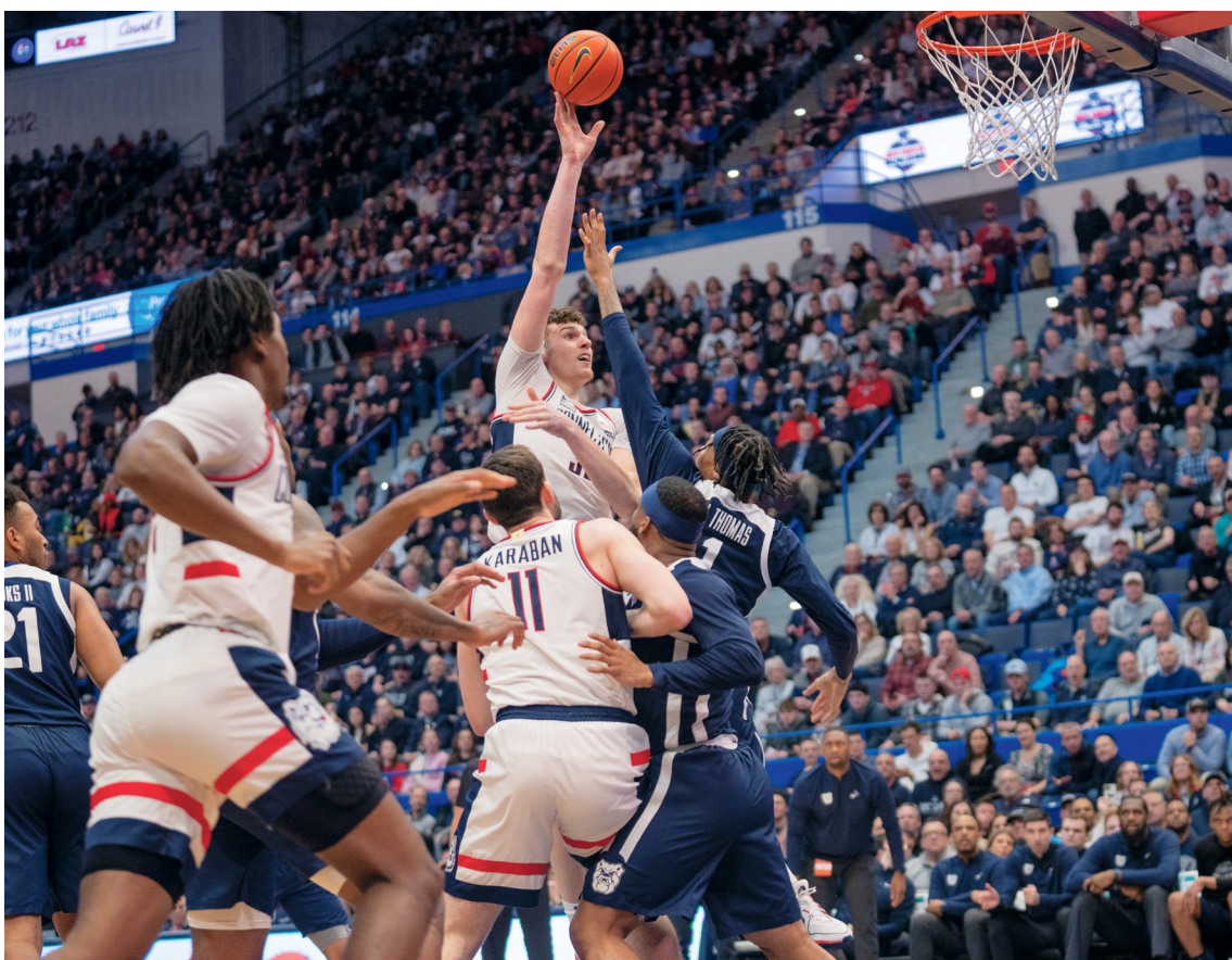
UConn Men's Basketball wins against Butler at the XL center with a score of 72-61. This was the team's 11th straight win.

With the No. 1 team in the nation playing to their identity, they walked into the locker room up 52-28. The large Husky crowd in attendance had seen an incredible showing, from plenty