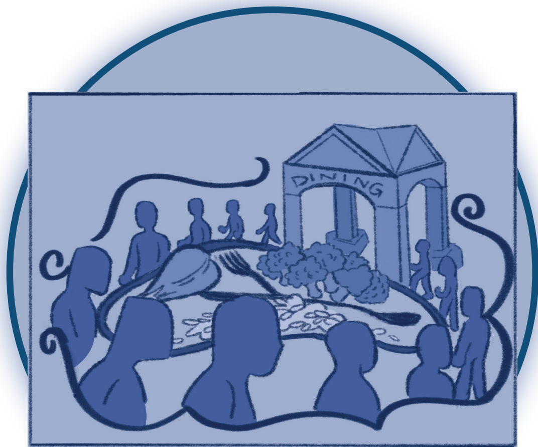
CARTOON BY LEE ERNST, CONTRIBUTING ARTIST/THE DAILY CAMPUS

We agree on the policy issues that need to be tackled, but hate each other's guts. How do we solve this? That is the million dollar question. If the American people can take off their political blinders and be open to new ideas (it doesn't mean you have to agree with them), not play for blue team or red team and be objective about simple facts (such as more guns makes the country less safe, anthropogenic climate change is happening) then it is possible to rally around policy, and not hold such disdain about the political opposition. If the media, pundits and politicians gave credit (where it was due) on specific issues to the opposition, viewers could see that they are being fair, objective and not partisan hacks. I probably disagree with Rep. Matt Gaetz on 90% of his policies, but I agree with his efforts to ban lawmakers from trading stocks. If I was in Congress, I would work hand in hand with him, not chastise him because he has an R next to his name. It's easier said than done for sure, but if we can make collective efforts to not play for a team, and be consistent on policy beliefs, then we can truly change affective polarization.