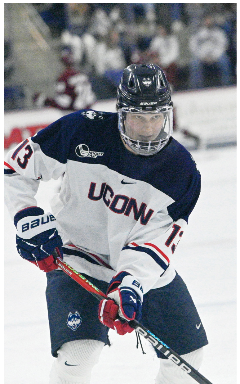
The Huskies face off against the Minute Men on Friday, Feb. 9 at the Toscano Family Ice Forum. Unfortunately, UConn got shutout two-to-zero.

The Ice Bus' next chance to right the ship will be two weekends from now when they face a daunting challenge in No. 3 Boston University. The two programs will meet for two matchups, with the first being played on Friday, Feb. 23, at the Toscano in Storrs. Action will then turn to the Agganis Arena in Boston for game two on Saturday, Feb. 24. The puck-drop for both games is set for 7 p.m. Fans at home can catch both games on ESPN+.