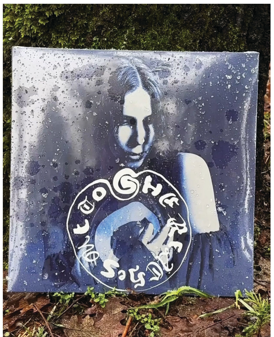
Chelsea Wolfe's new album, "She Reaches Out to She Reaches Out to She," is now available for streaming. Wolfe posted this in celebration of its release on Friday, Feb. 9.