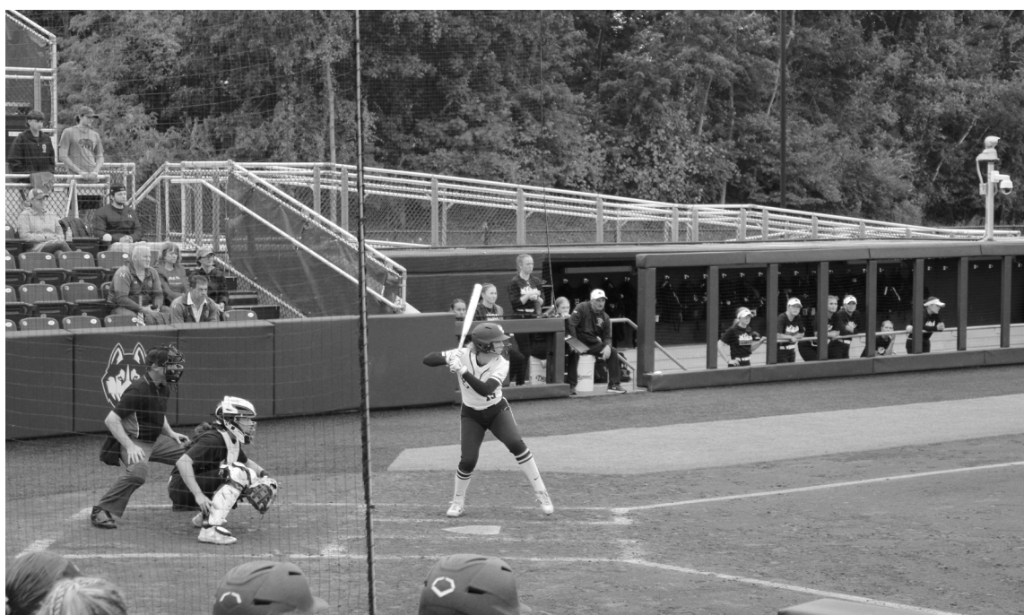
UConn softball players wear pink ribbons in honor of Breast Cancer Awareness Month during their game against Franklin Pierce University on Oct. 7, 2023. This was one of the team's eight exhibition games that they will play this season.