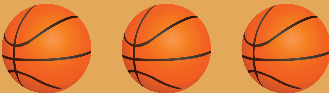
CARTOON COURTESY OF RAWPIXEL

PHOTOGRAPH BY CONNOR SHARP, STAFF PHOTOGRAPHER/THE DAILY CAMPUS