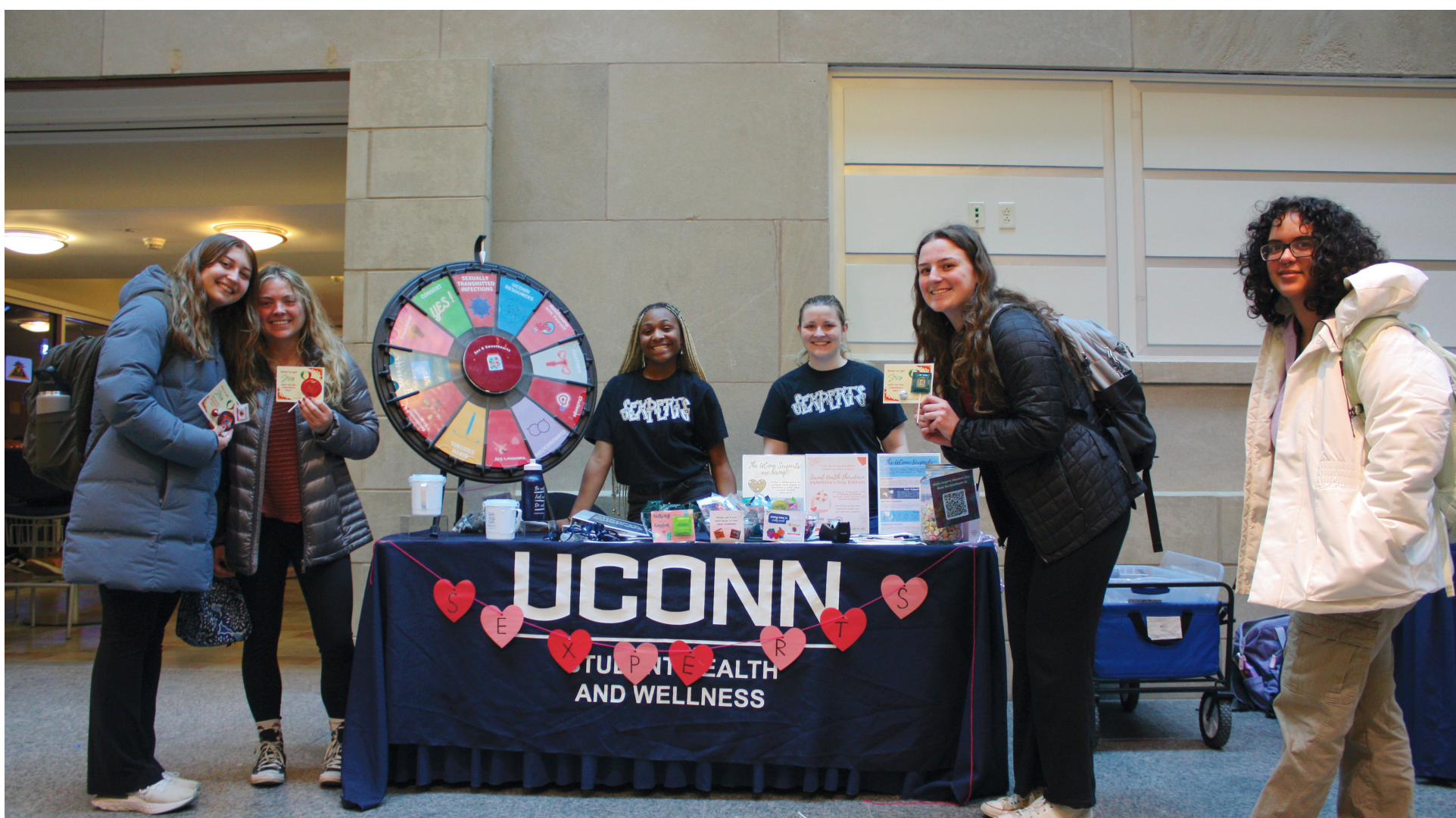
Sex & Sweethearts with the UConn Sexperts at the Student Union on Feb. 9, 2024. The UConn Sexperts educated students on safe sex.

The UConn Sexperts website The UConn Sexperts | Student Health and Wellness gives you all kinds of information. From the application to become a sexpert, to their drop-in hours and even an Ask the Sexperts forum online — which is anonymous for those who have questions but don't want to talk in person. You can learn so much just from their website, but if you go into their office, they can talk to you and a partner or just yourself about any questions you have. With Valentine's Day quickly approaching, check out the sexperts and other Student Health and Wellness services!