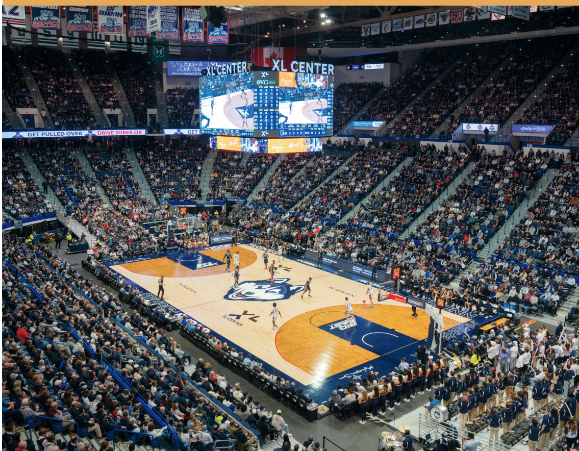
The Huskies played at the XL Center against Butler on Tuesday, Feb. 6th. The final score came out with the Huskies on top, 72-61.