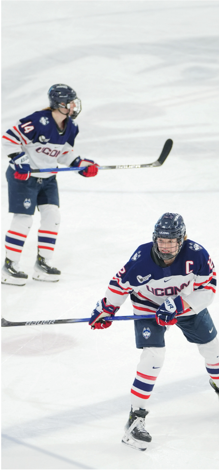
UConn takes the win over Providence two-to-one after going into overtime on Saturday Feb. 3rd. UConn Womens hockey is currently ranked No. 11.