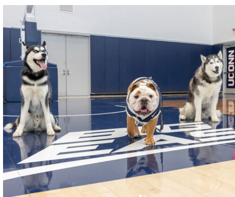
@uconn Three very good boys. No additional notes.