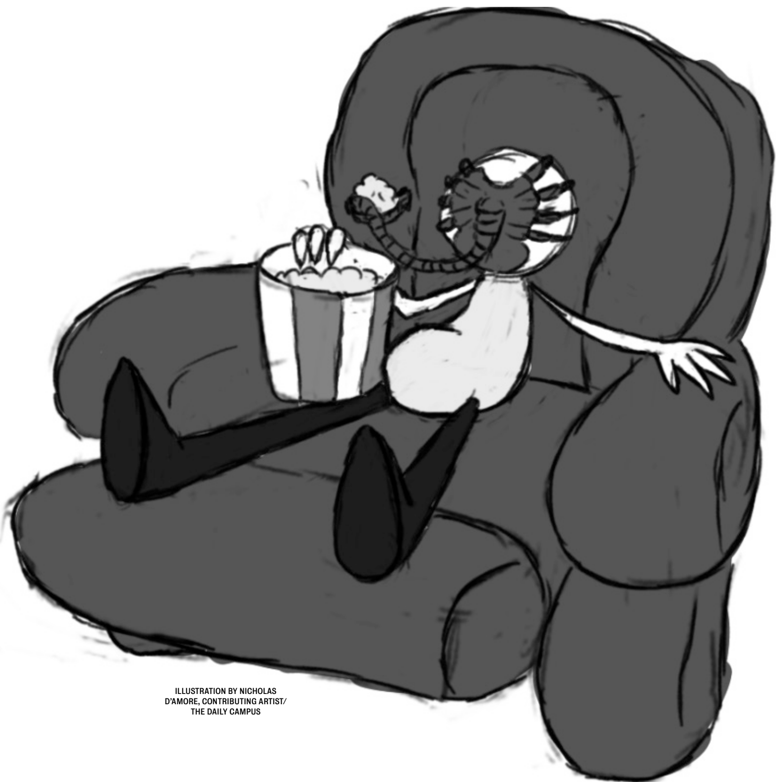
ILLUSTRATION BY NICHOLAS D'AMORE, CONTRIBUTING ARTIST/ THE DAILY CAMPUS

by Desirae Sin | SHE/HER/HERS | STAFF WRITER | desirae.sin@uconn.edu