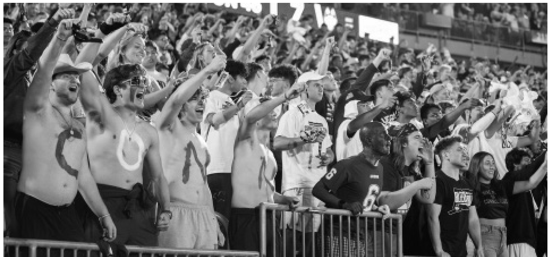
UConn student body cheering on the UConn football team. UConn's football team plays all their home matches at The Rent.

VERDICT: Very true. No. 5 Notre Dame scored 14 points and lost to Northern Illinois. No. 7 Oregon has looked skittish at best in its two outings thus far. No. 8 Penn State took three and a half quarters to close out Bowling Green, and No. 10 Michigan lost by 19 at home this past weekend. The top-10 in Monday's AP Poll may look awkwardly different, with (aside from the top three of Georgia, Texas and Ohio State), no other teams being truly set in their rank. Sure, Ole Miss has outscored opponents 128-3 in 120 minutes thus far, but the Rebels have not played a team inside the top 110 in ESPN's preseason FPI. Alabama's deceiving 42-16 win against USF protected the Tide's stock marginally, with the same being true for Missouri (No. 9). Look for a lot of teams entering the top-10 this weekend, including Miami, Tennessee and Utah.