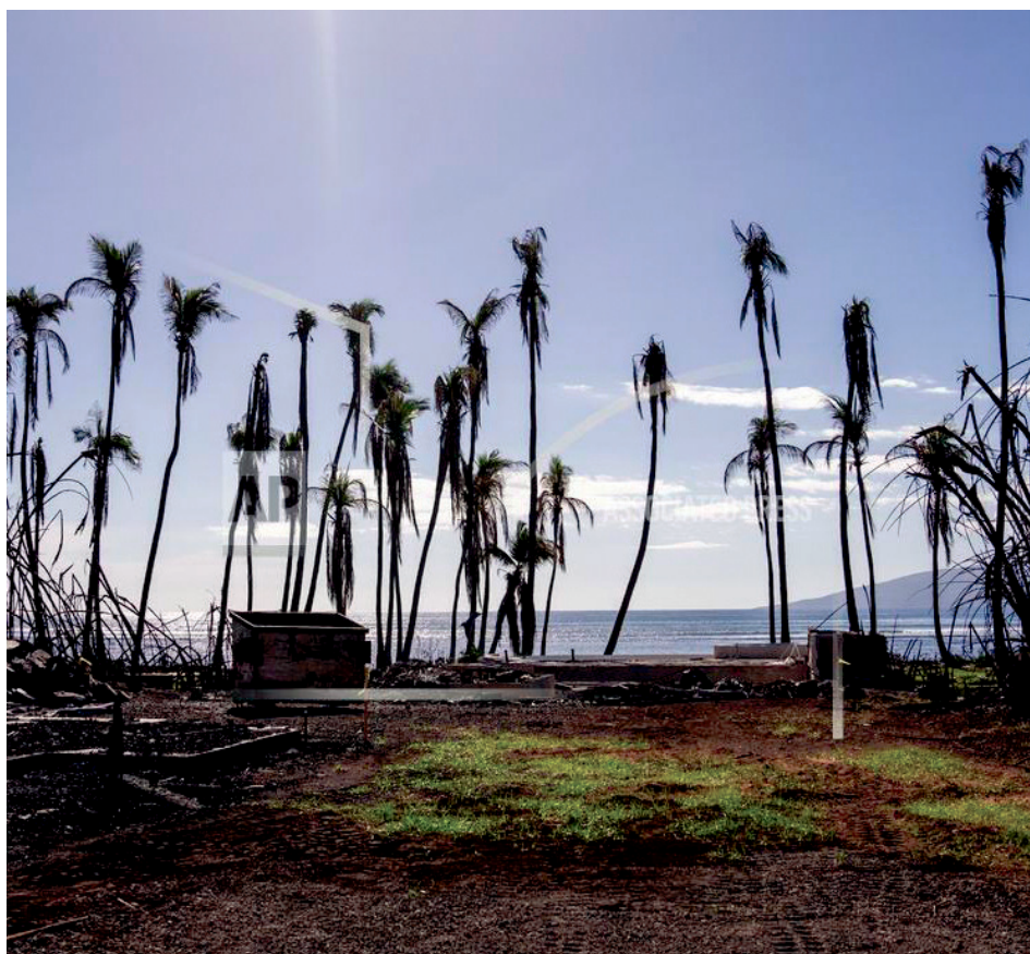
Wilted palm trees line a destroyed property, Friday, Dec. 8, 2023, in Lahaina, Hawaii.