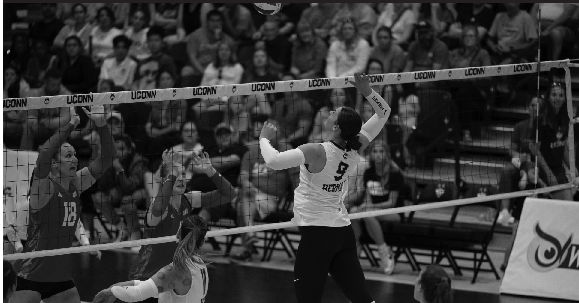
Sunday afternoon the UConn huskies gain a win against Sacred Heart in three sets. The Huskies have now played six games this season.