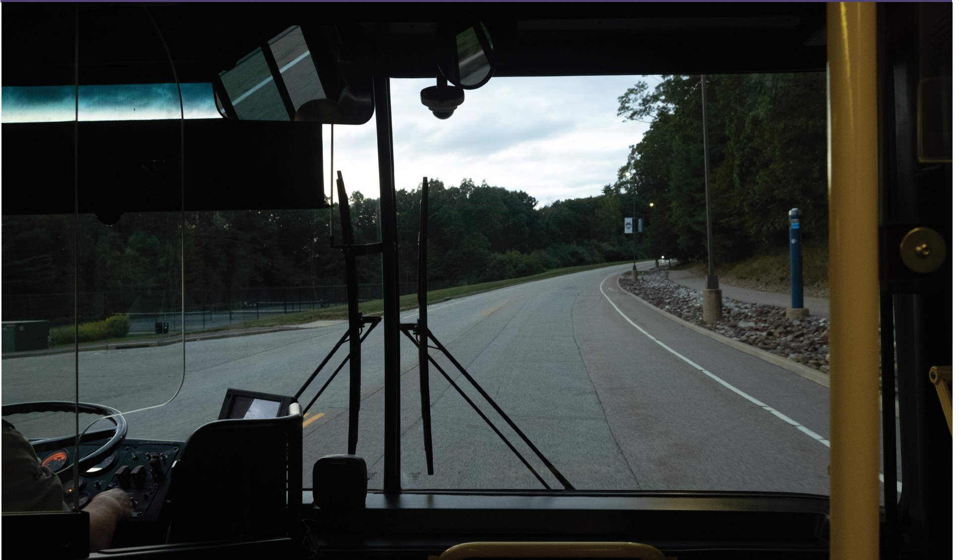
A perspective of a student looking outward of a UConn bus' front view window. Transportation services are essential to travel around campus.