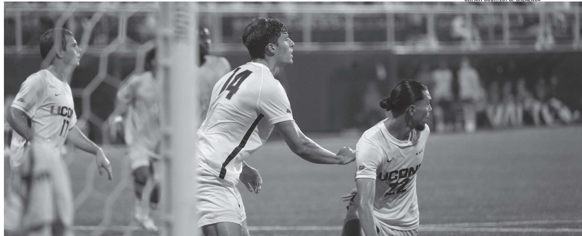
A Heated matchup Sunday night for UConn men's soccer ends in a draw. The final score for the game against Long Island University was 0-0.