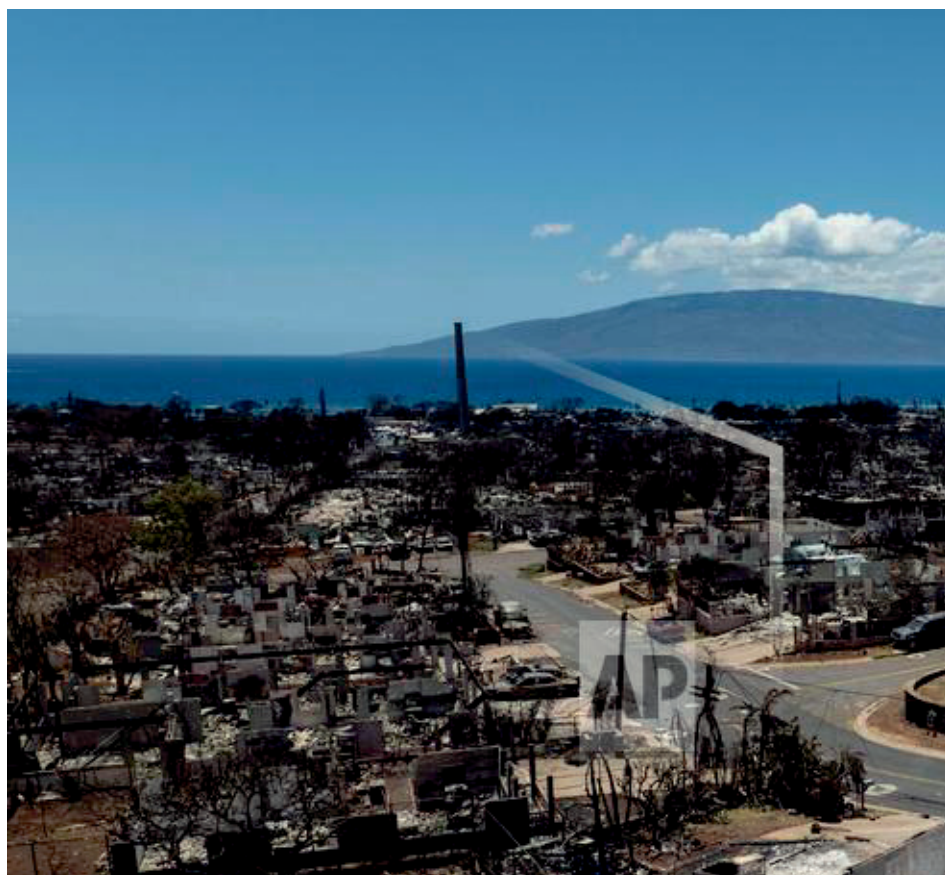
Destroyed homes are visible in the aftermath of a devastating wildfire in Lahaina, Hawaii, Tuesday, Aug. 22, 2023.