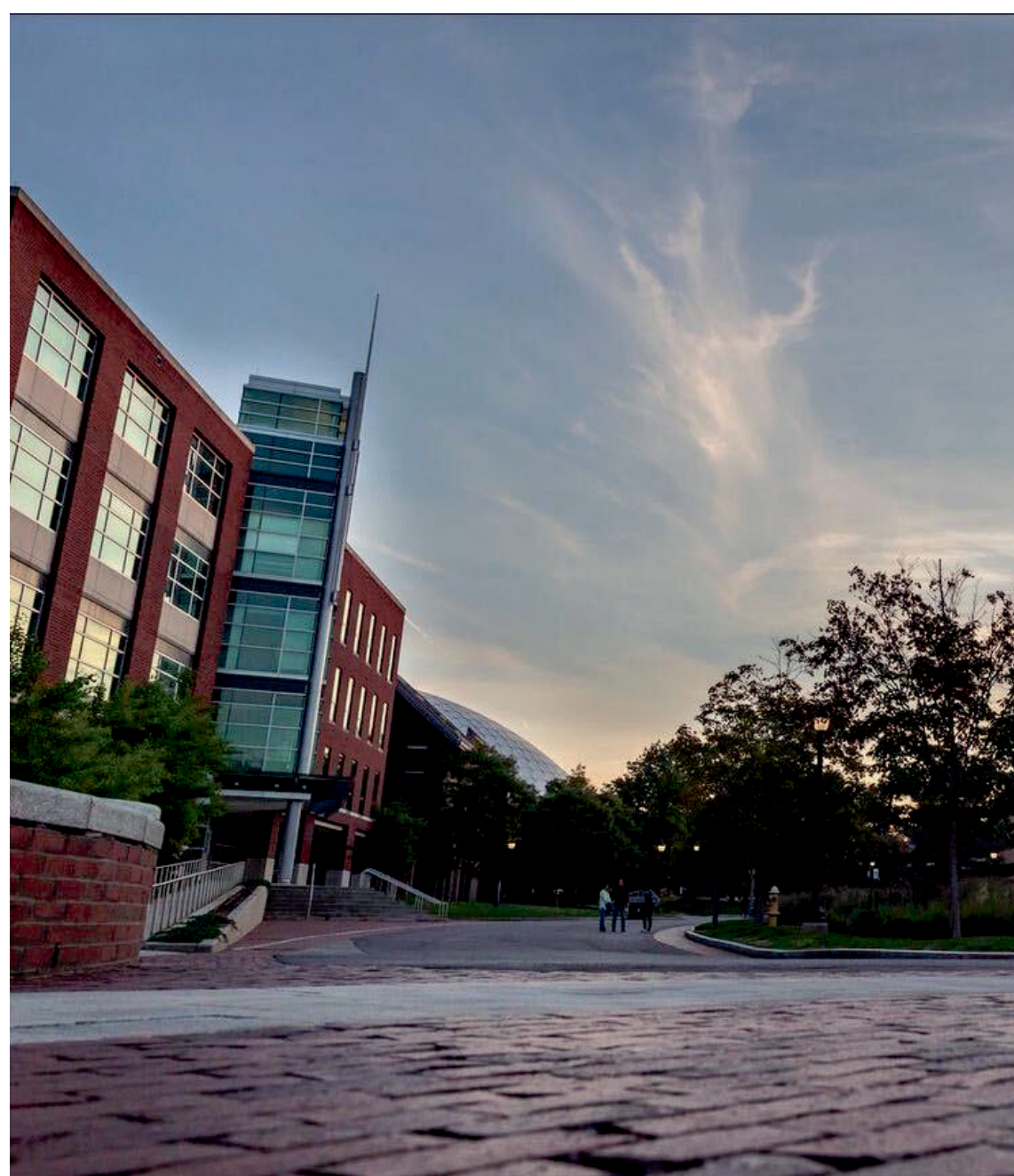
Students walking by the Information Technologies Engineering Building on Fairfield Way. Students can use this building as a study spot or for technological support.