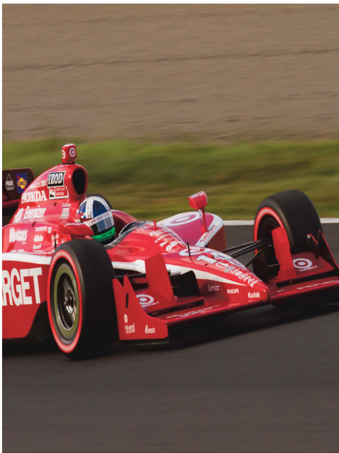
Dario Franchitti at the 2011 Indy Japan 300 qualifiers. The 2025 Indycar season began in St. Petersburg, Fla.