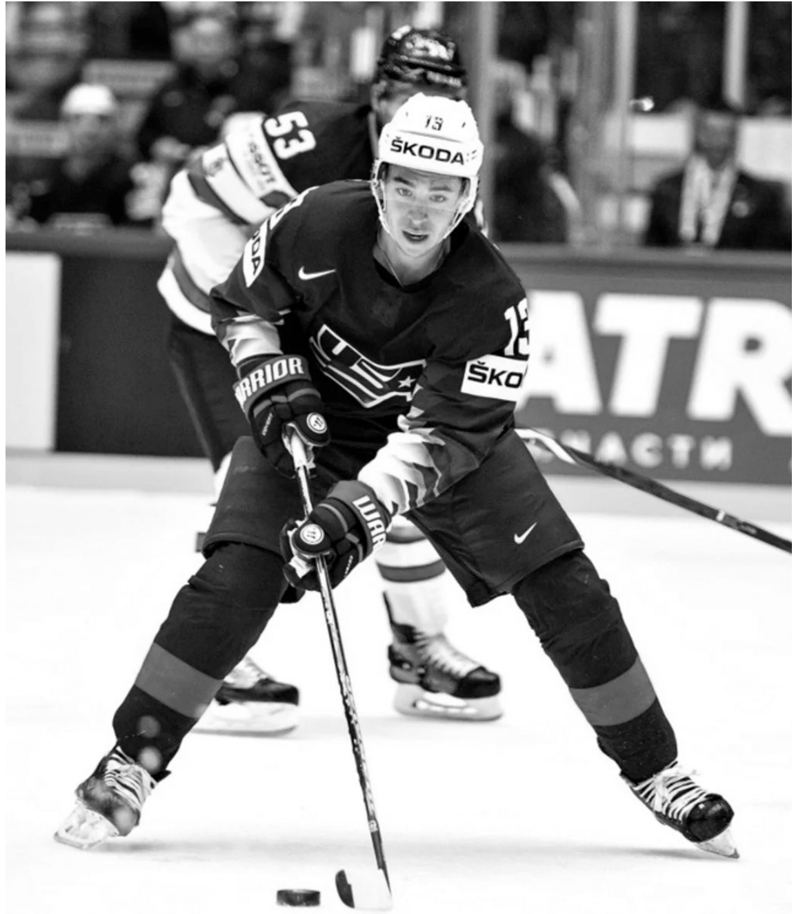
Johnny Gaudreau's show-stopping skills on the ice earned him the nickname 'Johnny Hockey.'