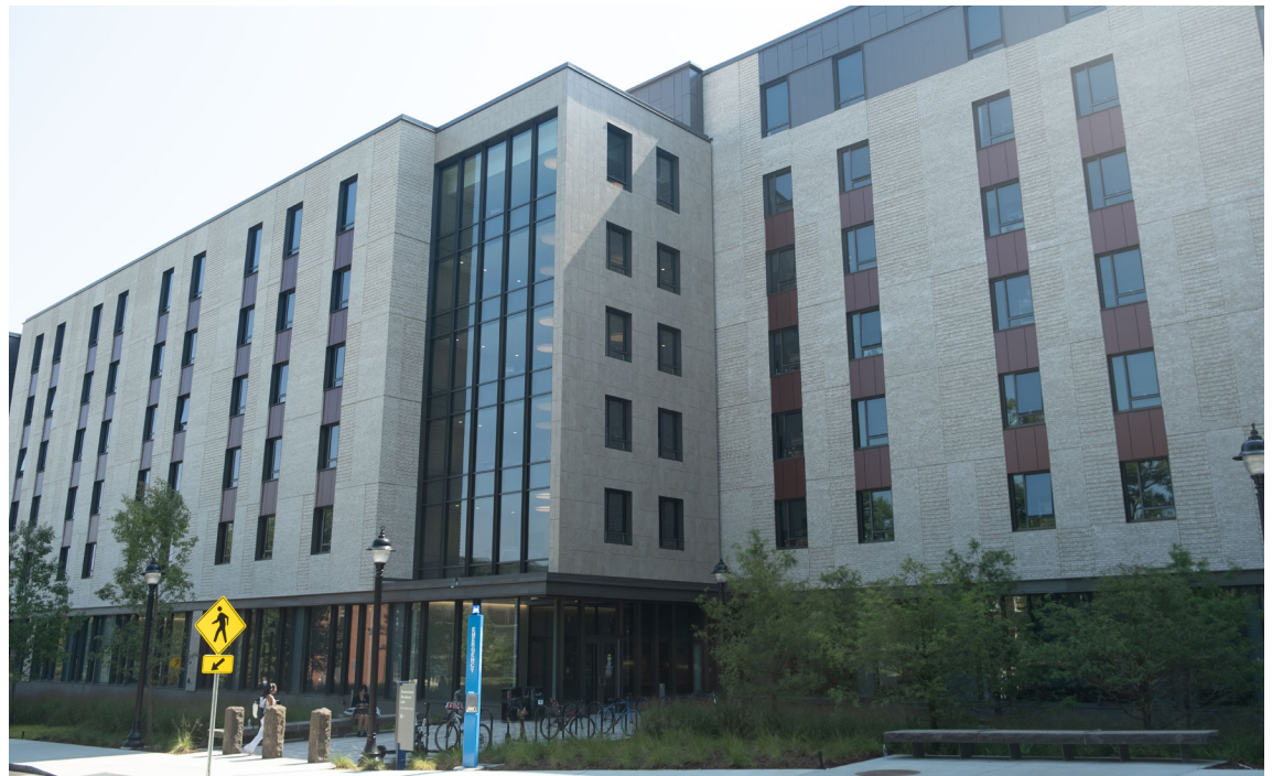
Connecticut Hall at the UConn Storrs campus on Aug. 27, 2024. Connecticut Hall is the newest residential and dining addition to the Storrs campus.