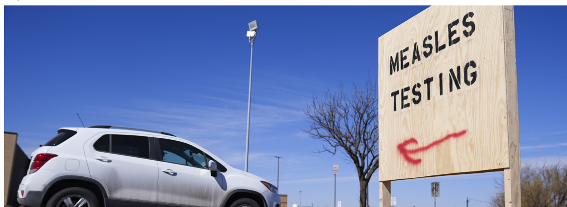
A vehicle drives past a sign outside of Seminole Hospital District offering measles testing Friday, Feb. 21, 2025, in Seminole, Texas.

U.S. kindergarten vaccination rates dipped in 2023, and the proportion of children with exemptions rose to an all-time high, according to federal data posted in 2024.