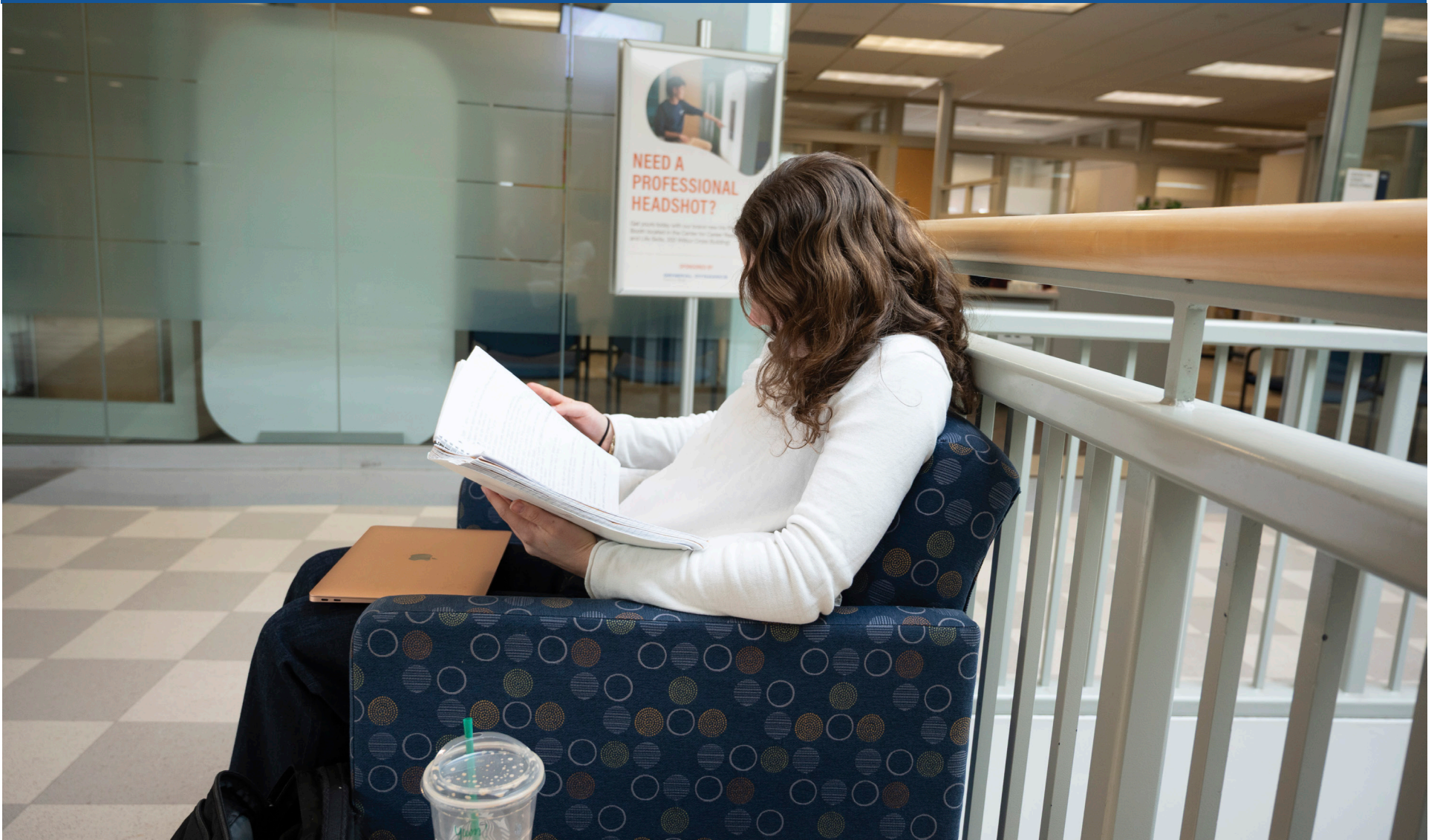
A student at the Wilbur Cross Building studying in Storrs, Conn. on March 4, 2025. The central location of the building on campus makes it easy for students to stop by in between classes.

Photo of the Day | You have been sentenced to studying for midterms