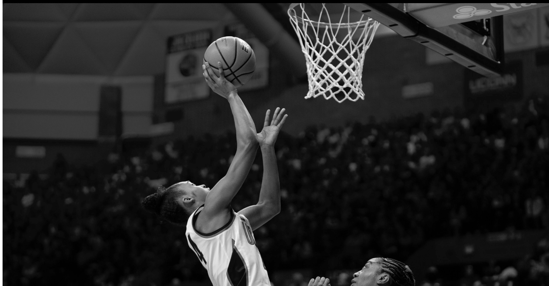
The UConn Huskies defeat Marquette 92-57 at Gampel on March 2, 2025. Following the game, UConn honored the seniors on the team and inducted Paige into the Huskies of Honor.