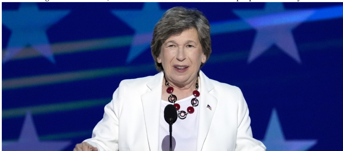
Randi Weingarten, president of the American Federation of Teachers, speaks during the Democratic National Convention Aug. 22, 2024, in Chicago, Illinois.

The American Federation of Teachers is one of the nation's largest teachers unions. The sociological association is a group of about 9,000 college students, scholars and teachers. Both groups say their members teach lessons and supervise student organizations that could jeopardize their schools' federal money under the memo.