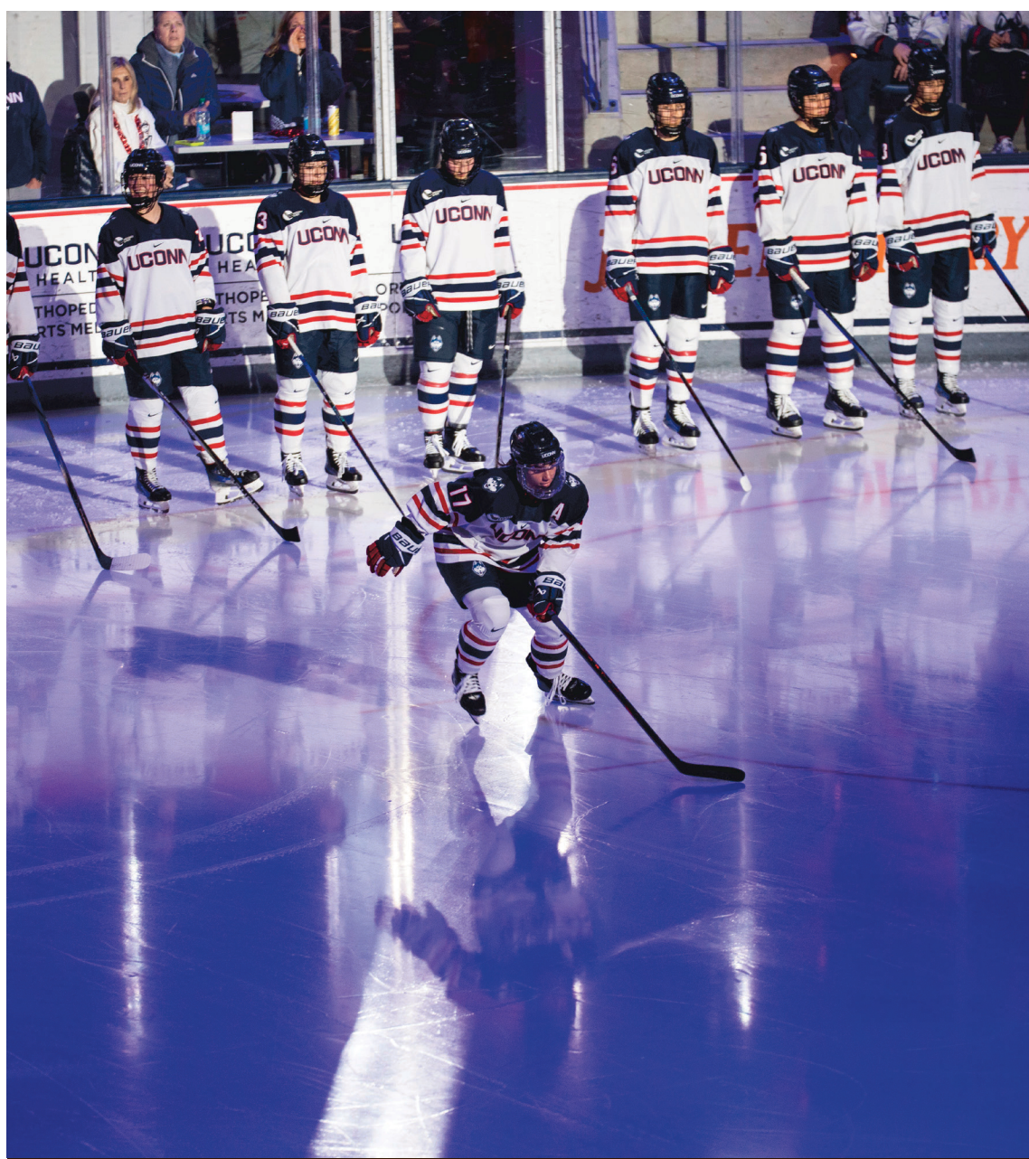
UConn women's hockey beats Merrimack 4-0 to move on to the Hockey East Tournament semifinals on March 1, 2025. The Huskies will face off on Wednesday March 5 at 6pm at Toscano Family Ice Forum in Storrs, Conn.

With one of the best goalies in the conference in freshman