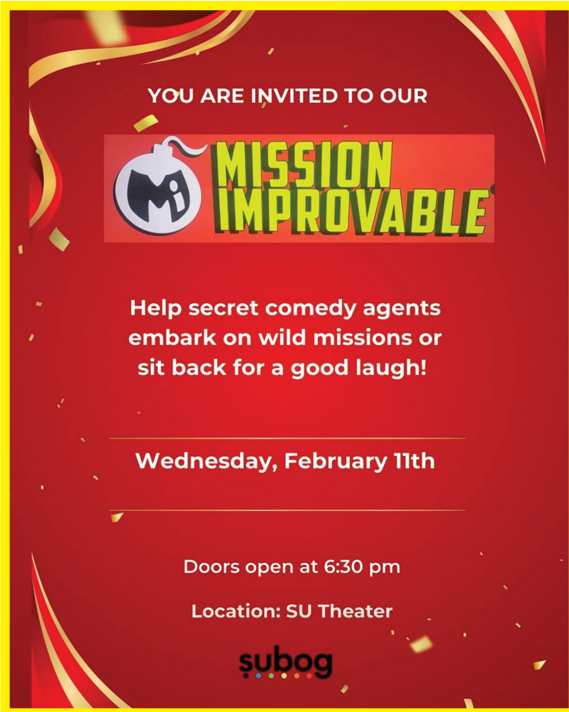
A promotional graphic for SUBOG’s Mission Improvable show. The show featured several improv games that emphasized audience participation.

“It kind of had an entertainers’ slant to it, and I think it helped keep the audience engaged,” she said. “I feel like they were fantastic improvisers, fantastic comedians. They did a great job engaging with a small crowd.”