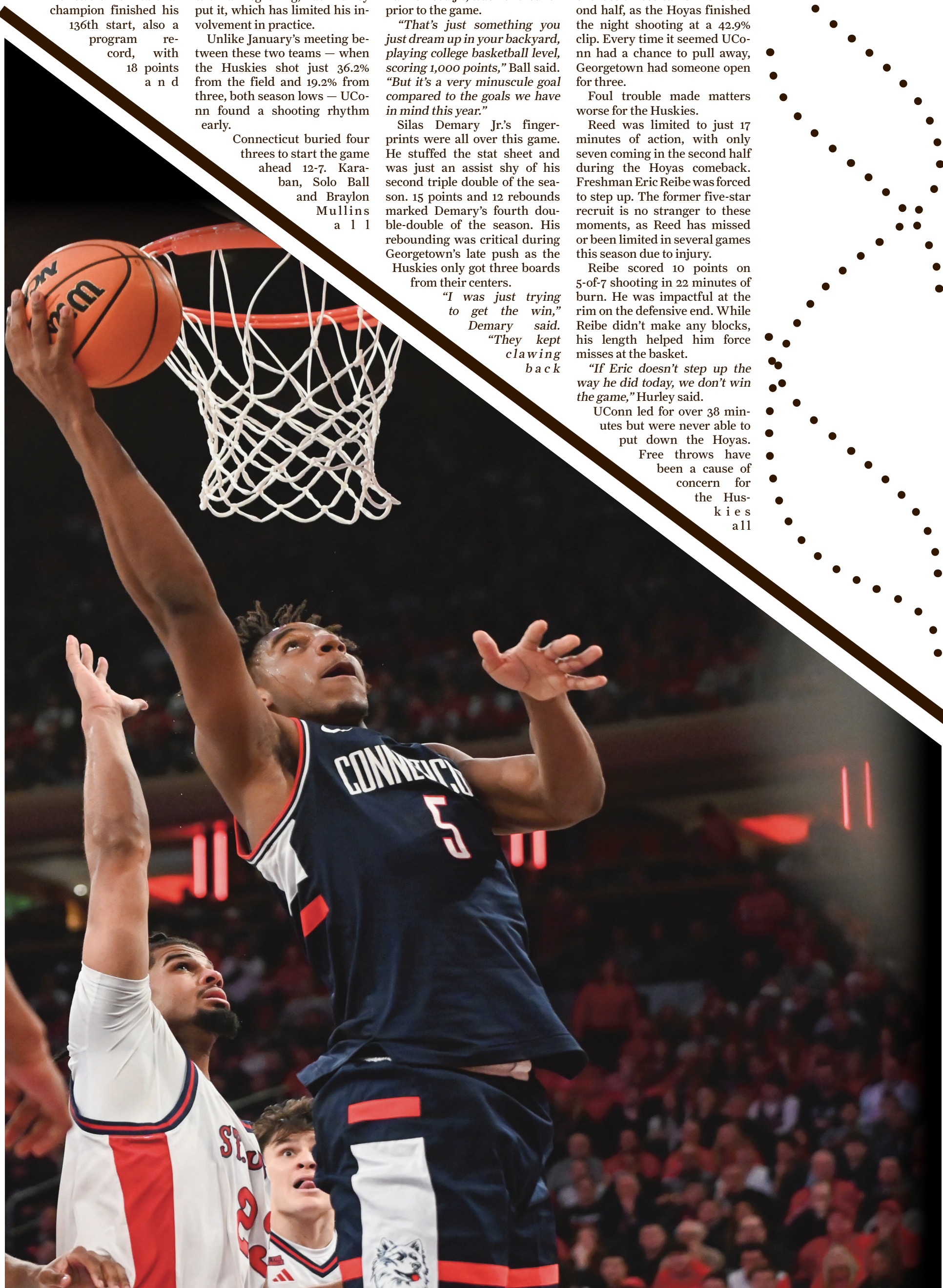
The UConn Huskies take on the St. John's Red Storm at Madison Square Garden in New York City on Feb. 6, 2026. Despite a close game, the Huskies lost 72-81.

The game tips off at 7 p.m. and is available on TNT.