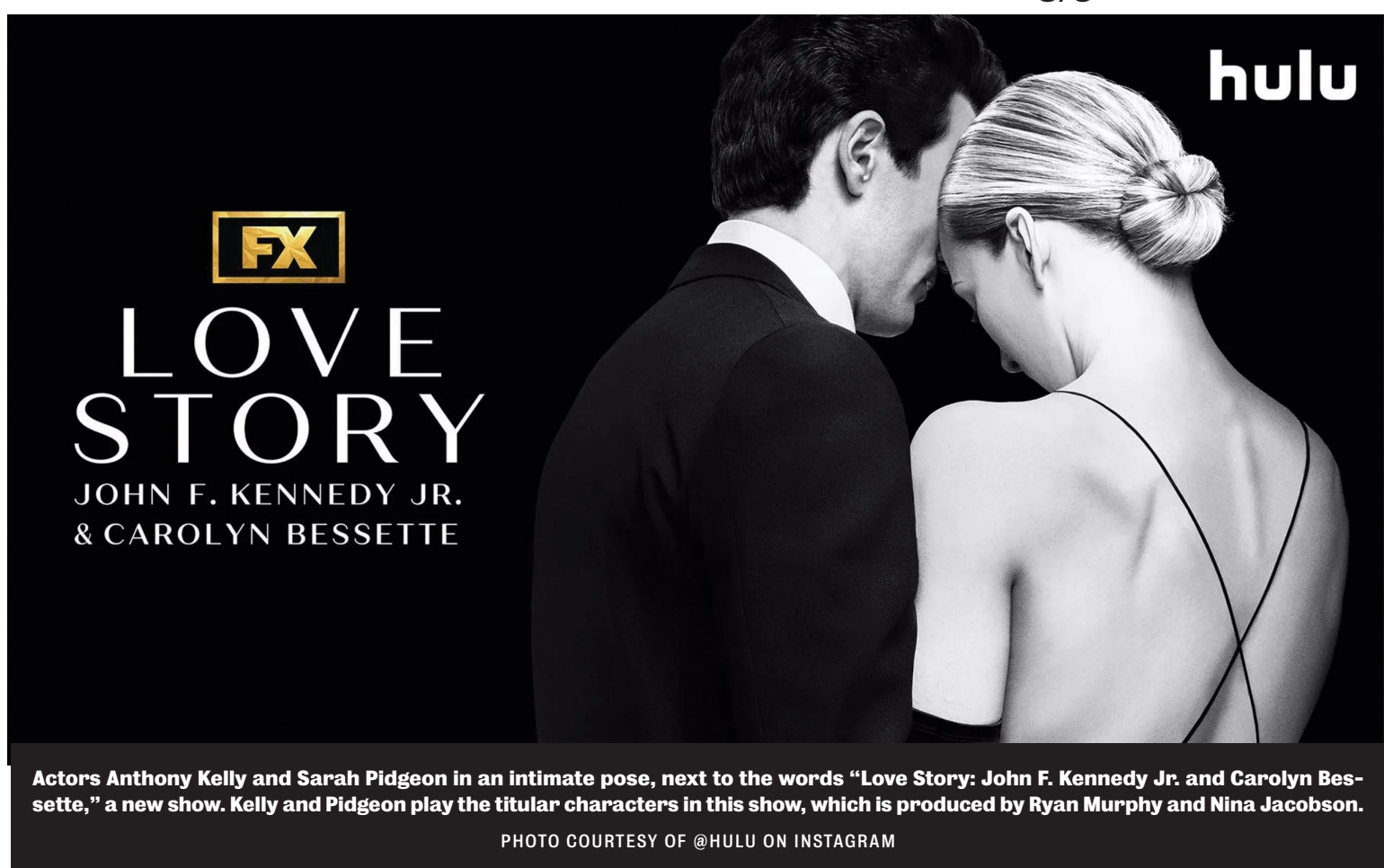
Actors Anthony Kelly and Sarah Pidgeon in an intimate pose, next to the words "Love Story: John F. Kennedy Jr. and Carolyn Bessette," a new show. Kelly and Pidgeon play the titular characters in this show, which is produced by Ryan Murphy and Nina Jacobson.