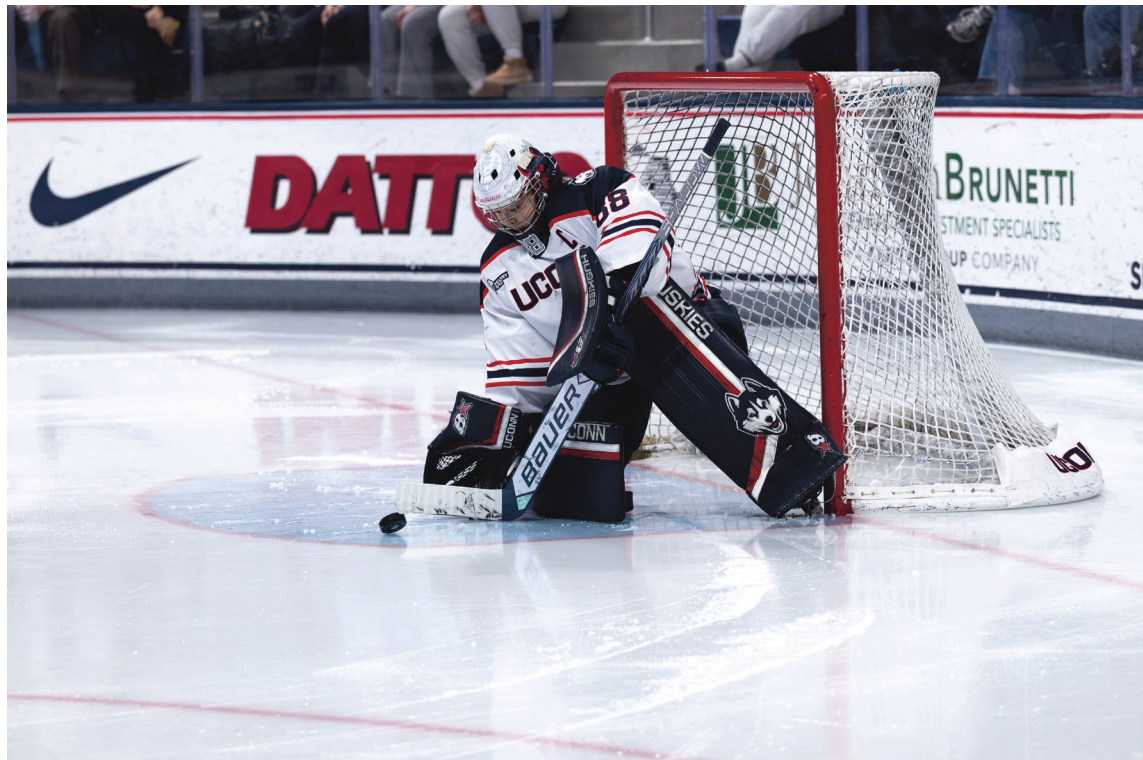
The UConn women's hockey team faces off against Boston College on Feb. 7, 2026. The teams were tied 0-0 at the end of the first period, but the Huskies went on to win the game 6-2.