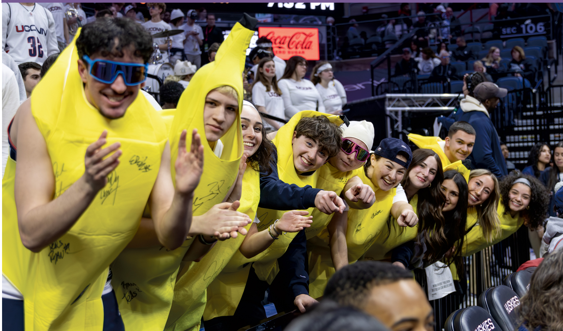
Students dress in banana costumes at the UConn men's basketball game at Gampel Pavilion on February 14, 2026. Students waited outside before the game to secure seats in the student section.