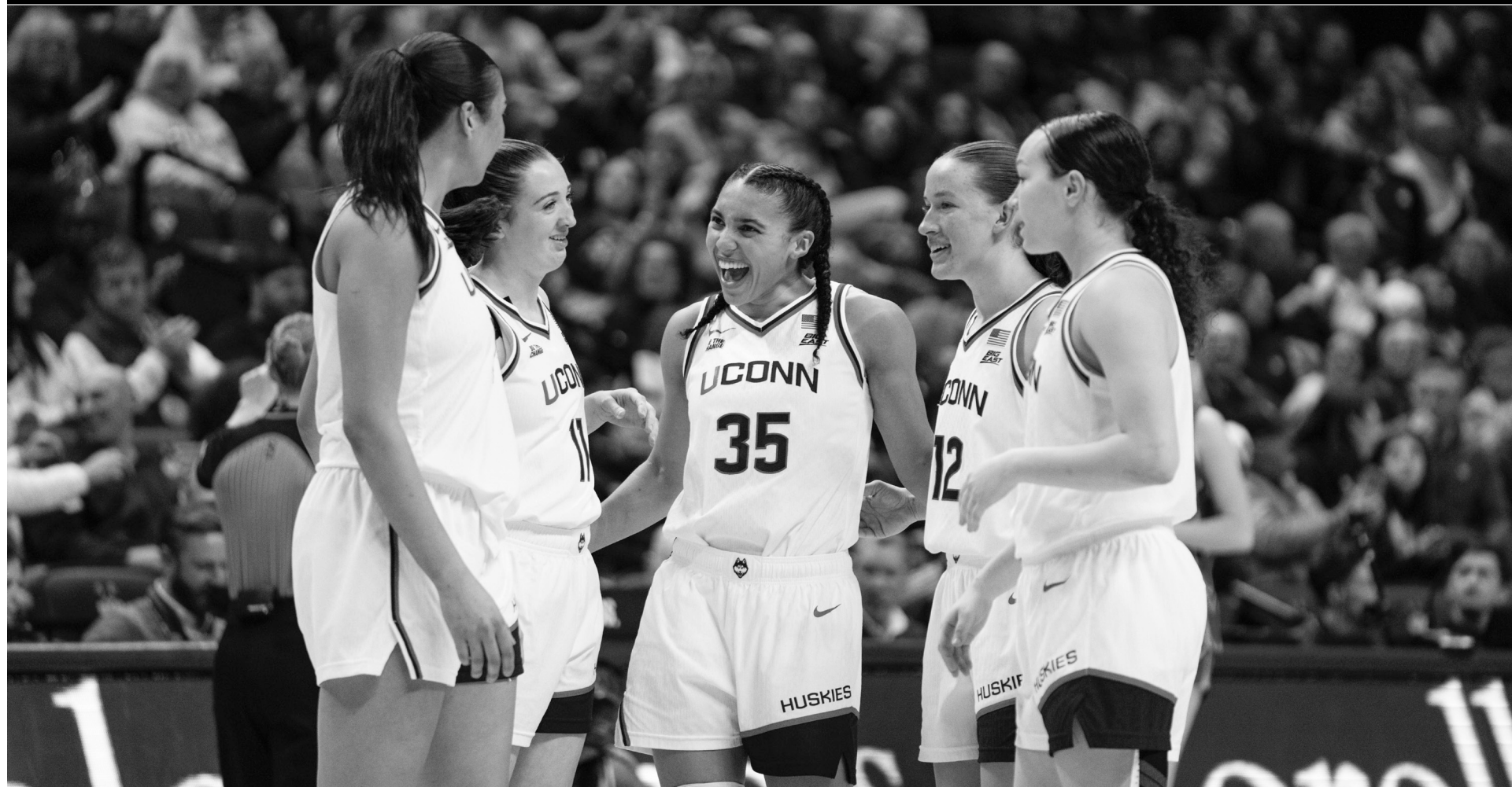
The UConn women's basketball team competes against Creighton. The game took place on Feb. 11, 2026.