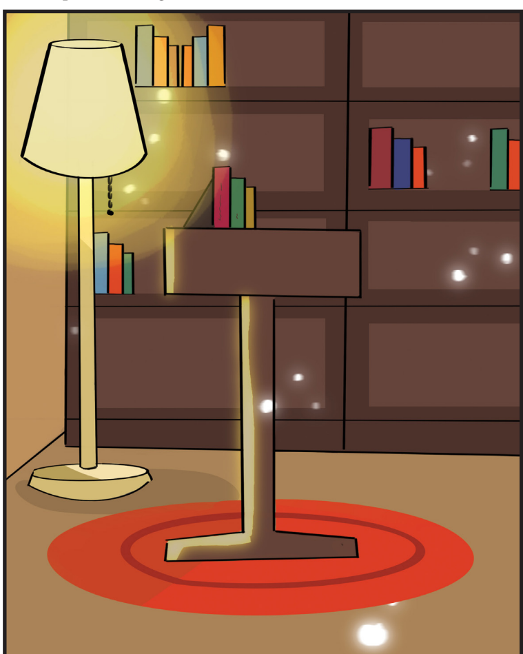
Graphic introducing the contest winners of the Long River Review. The first Long River Reading Series of the Spring 2026 semester took place on Wednesday, Feb. 11. PHOTO COURTESY OF @UCONNCW ON INSTAGRAM | ILLUSTRATION BY COSETTE ELLIS, STAFF ARTIST/THE DAILY CAMPUS