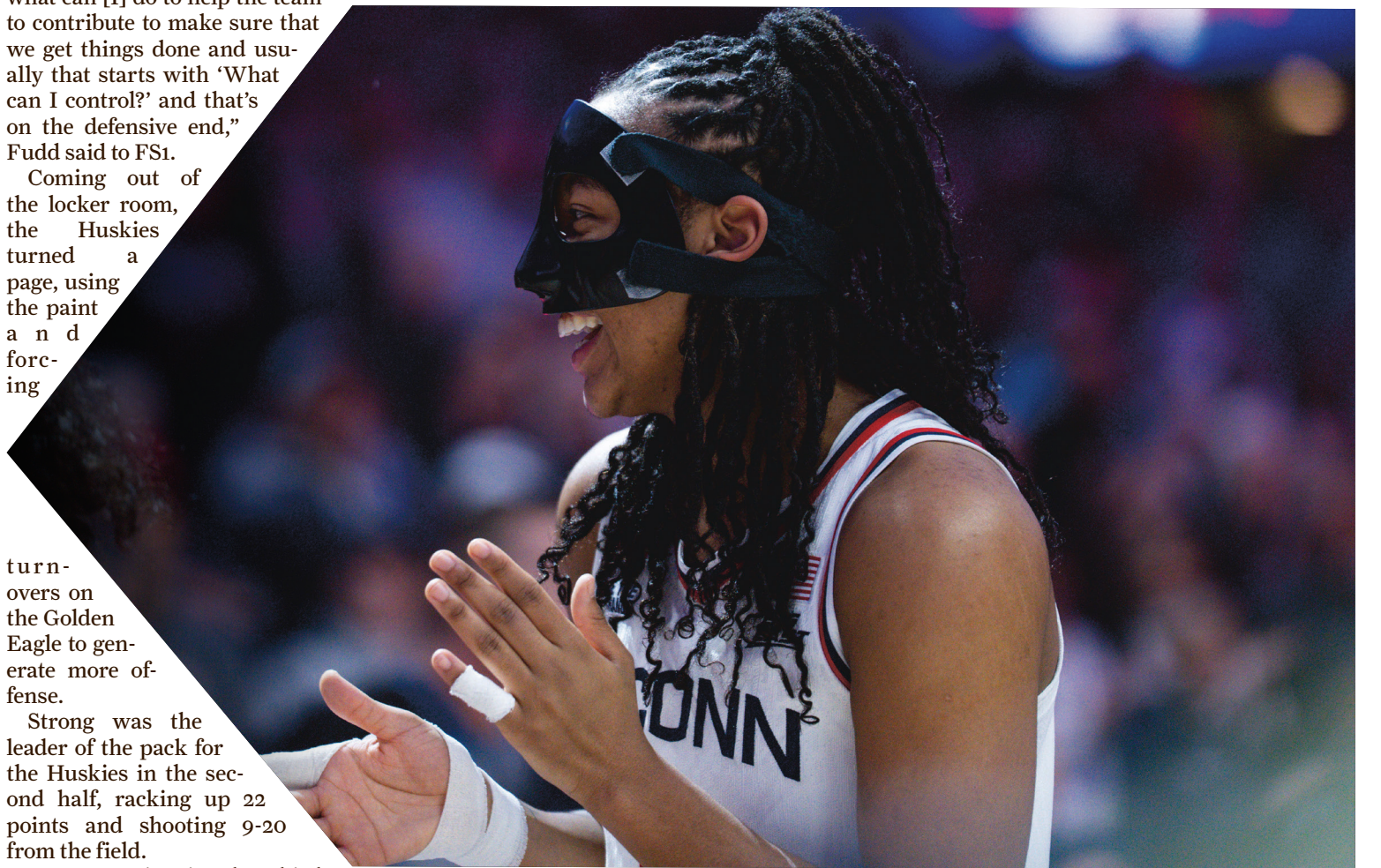
A player from the UConn women's basketball team. The Huskies faced the Marquette Golden Eagles this past Saturday, and won 71-56.

Tip-off is scheduled for 7 p.m. from Finneran Pavilion. Fans can tune in to the bout on Peacock.