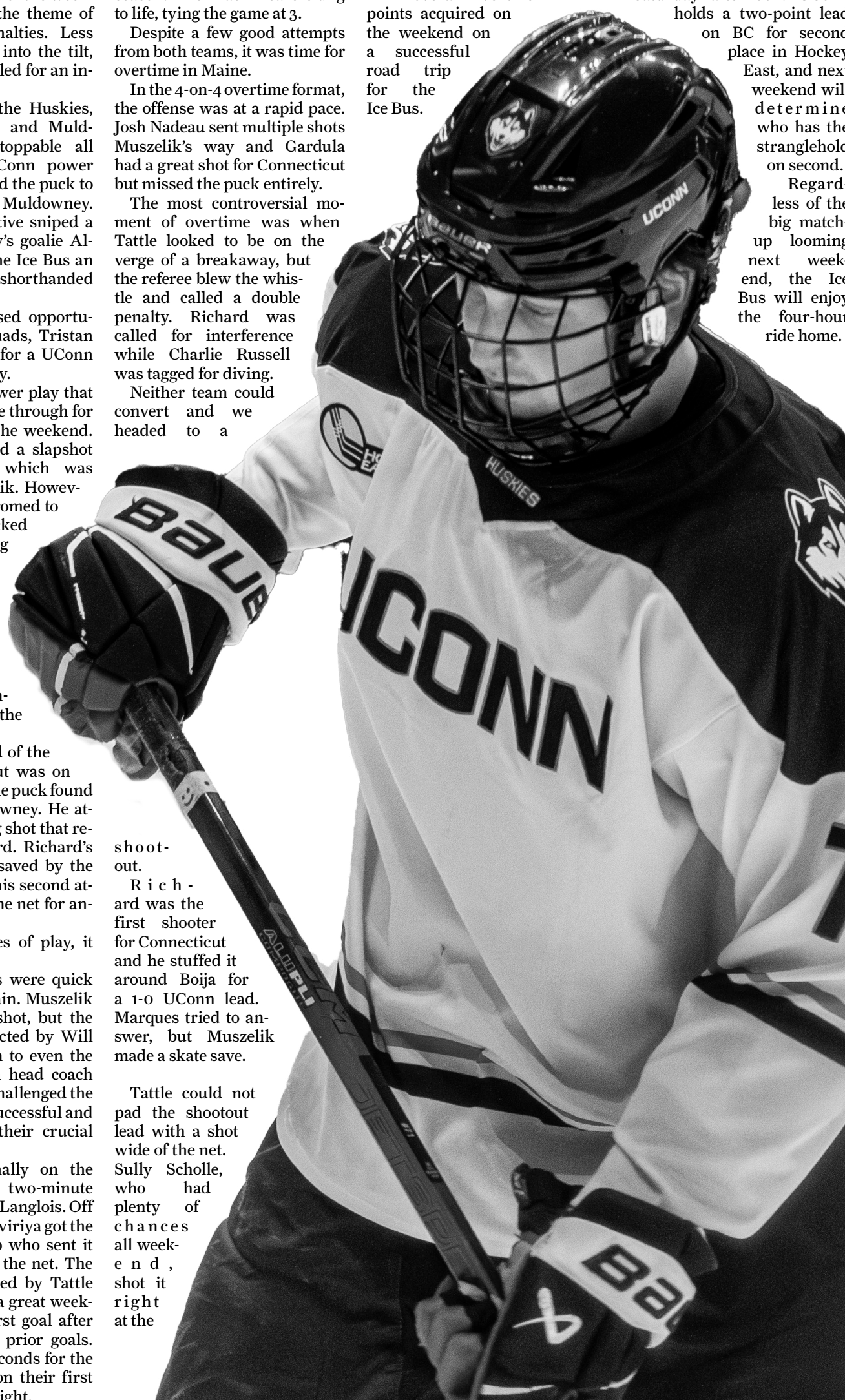
UConn men's hockey faces Ohio State on Oct. 18, 2025, at PeoplesBank Arena in Hartford, Conn. The Huskies lost 4-2 to the Buckeyes.

Regardless of the big matchup next weekend, the Ice Bus will enjoy the four-hour ride home.