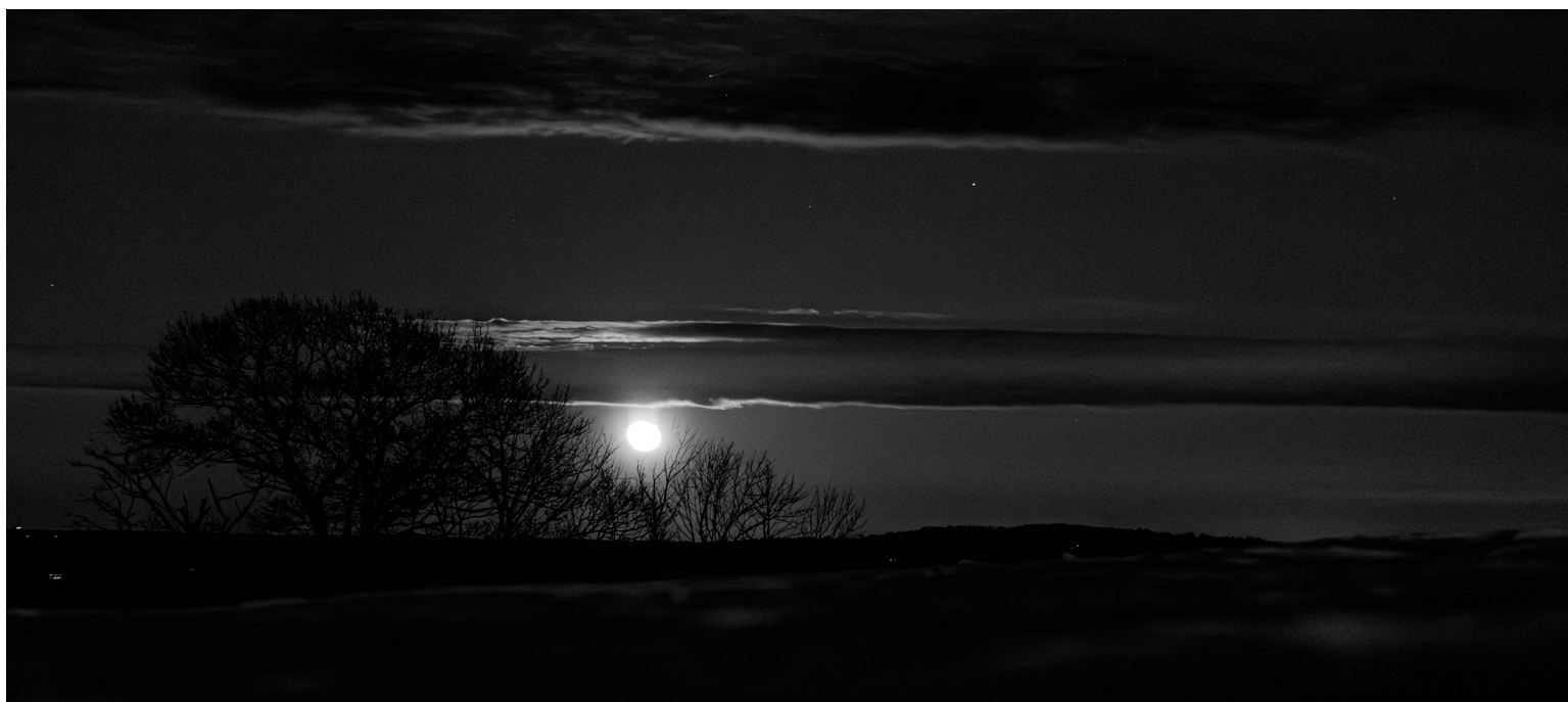
The moon rises over Horsebarn Hill on Tuesday, Feb. 3, 2026 in Storrs, Conn. The temperatures were chilly in the heart of winter.

The key to rising out of the hole is pure, unadulterated authenticity. And isn't that a