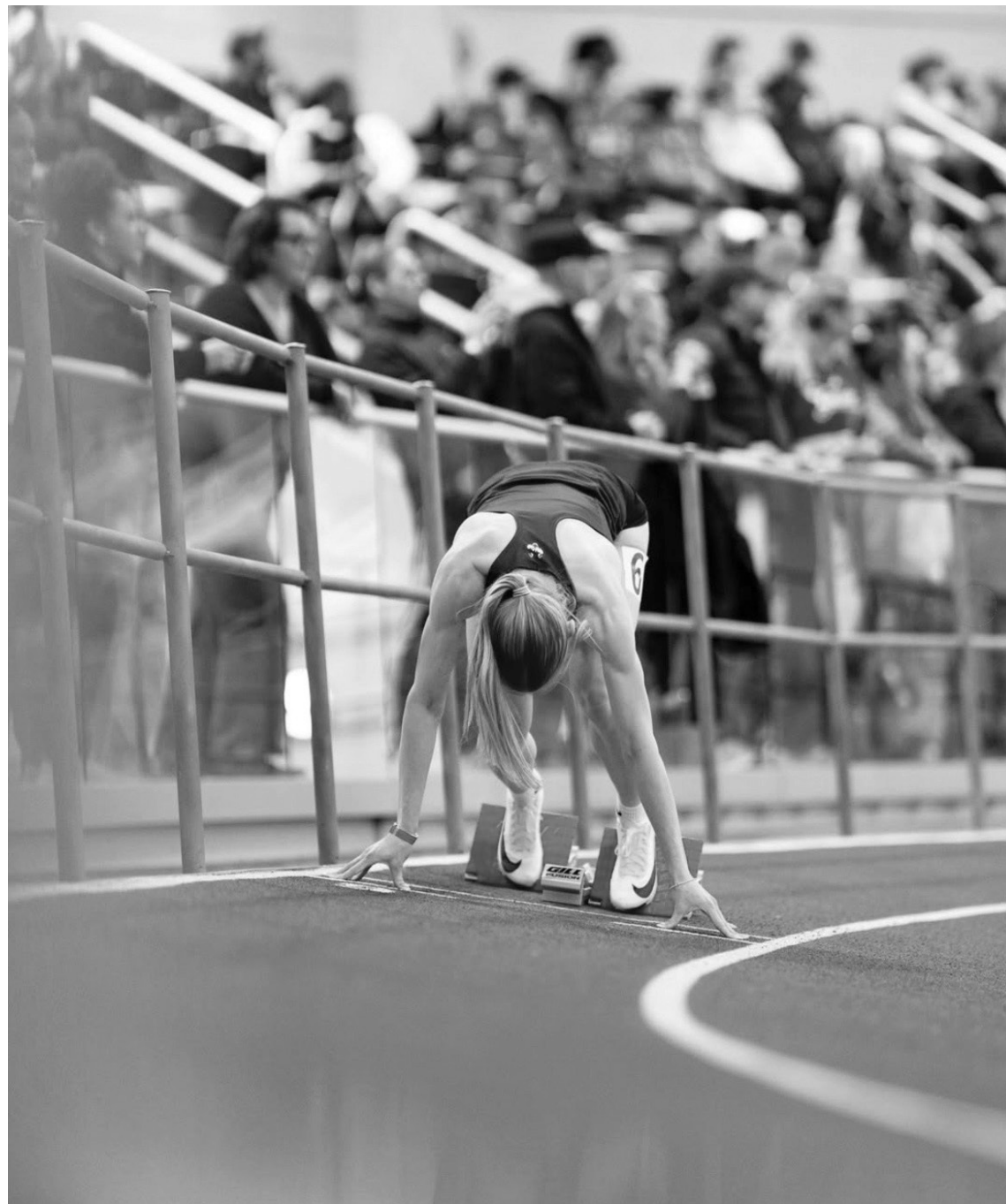
Members of the UConn track and field team in action. The Huskies competed in the Eagle Elite Invitational, the Valentine Invite and the Giegengack Invite this past weekend, and performed well in all.

their Big East title at the Big East Championship. The Huskies have demonstrated they are progressing competitively and will look to present that ability in Chicago from Feb. 28 to March 1.