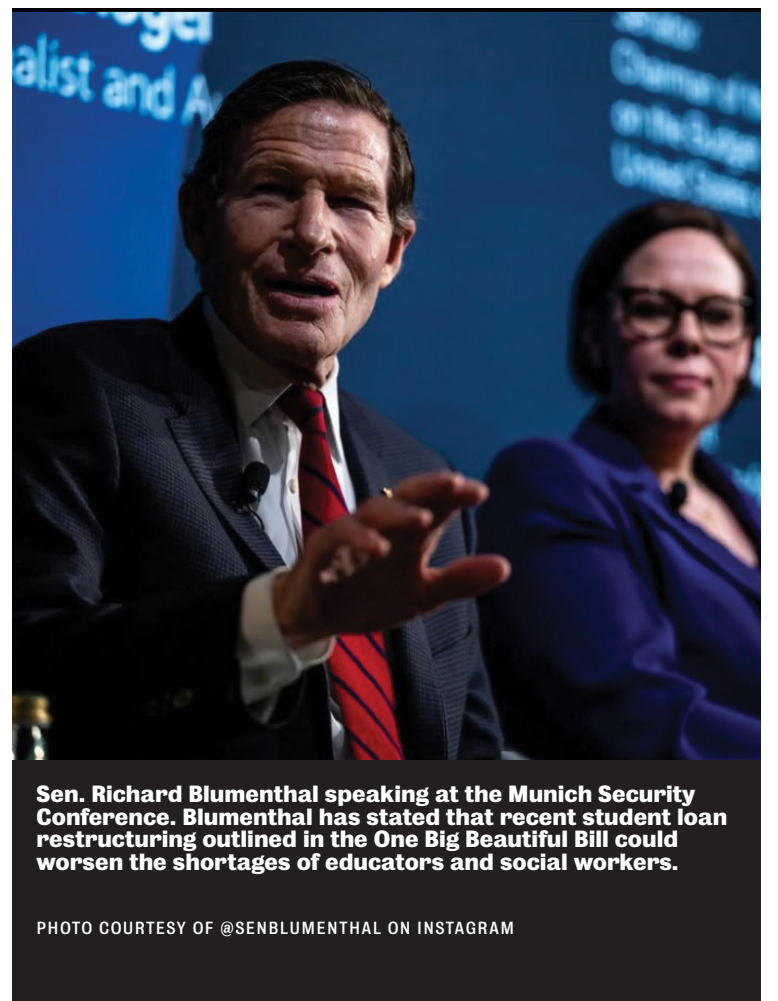
Sen. Richard Blumenthal speaking at the Munich Security Conference. Blumenthal has stated that recent student loan restructuring outlined in the One Big Beautiful Bill could worsen the shortages of educators and social workers.

"Public service is a calling for teachers and social workers, and the least we can do is enable them to afford financially and have access to the studies they are engaged in doing to acquire the skills that make them productive public servants," he said.