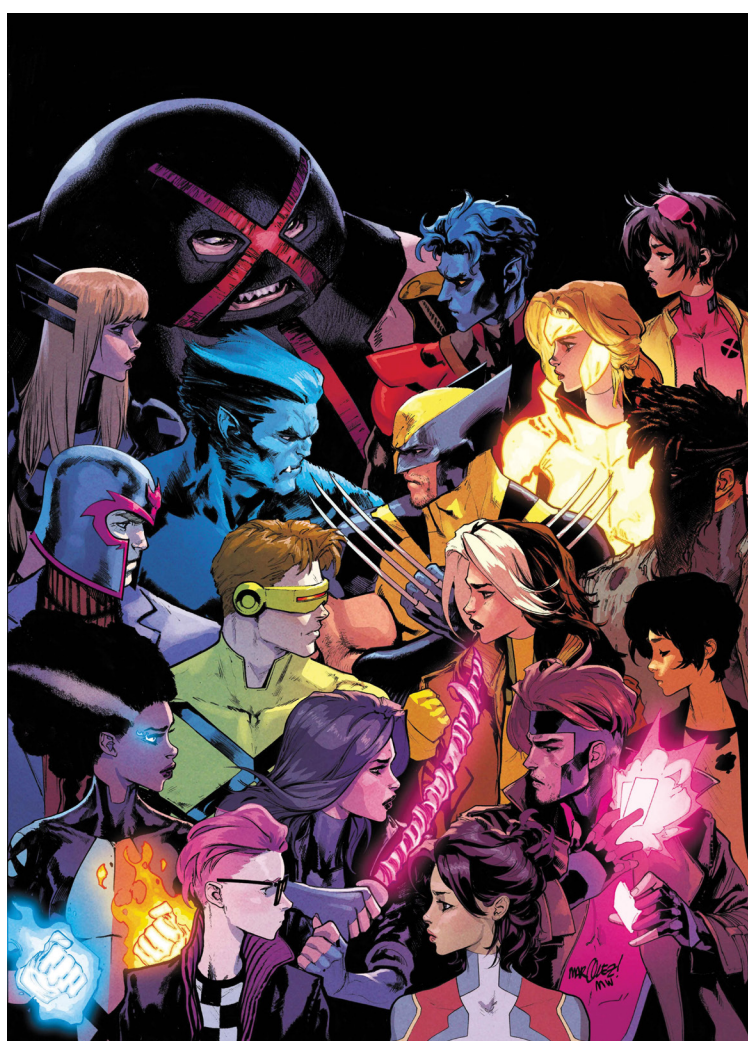
Comic book art depicting members of the X-Men, a superhero team. The X-Men films focus on relationships between members of the team, creating a strong sense of found family.

The Avengers films generally avoid these nuances in favor of having a shared enemy be enough, and any discrepancies come not from established character beliefs or dynamics, but