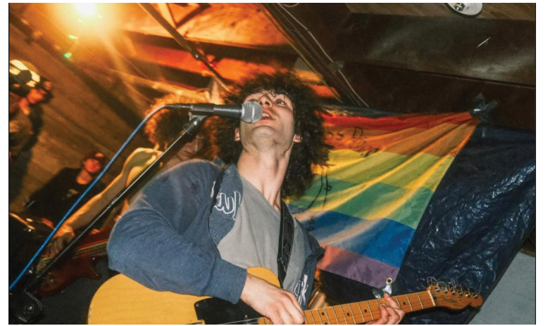
Photos from a show at Storrs-based DIY live music venue, The Dog Pound. The venue has had to switch locations following complaints from the Town of Mansfield and the University of Connecticut.