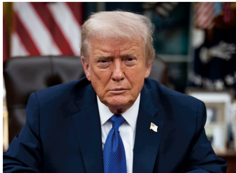
President Donald Trump sitting at his desk. He is the 47th president of the United States.

We will. Whether you are waiting it out or actively protesting and thinking of America's problems every single day, you do so with the knowledge that the future is not absolute and not everything is hopeless. Do not be discouraged.