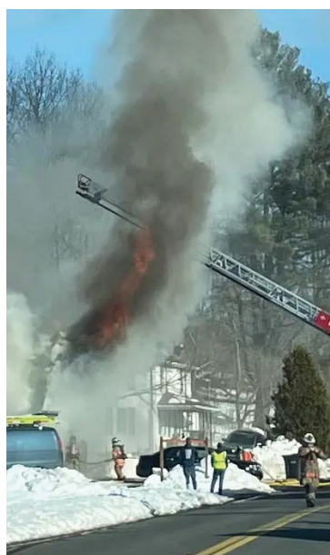
Fire crews responding to a smoking building. Mutual aid crews from Coventry and Mansfield fire departments responded to a fire on Horsebarn Hill this past Saturday, with additional crews responding in Downtown Storrs on Sunday, Feb. 15.

The Daily Campus will continue to report on the fires as more information becomes available.