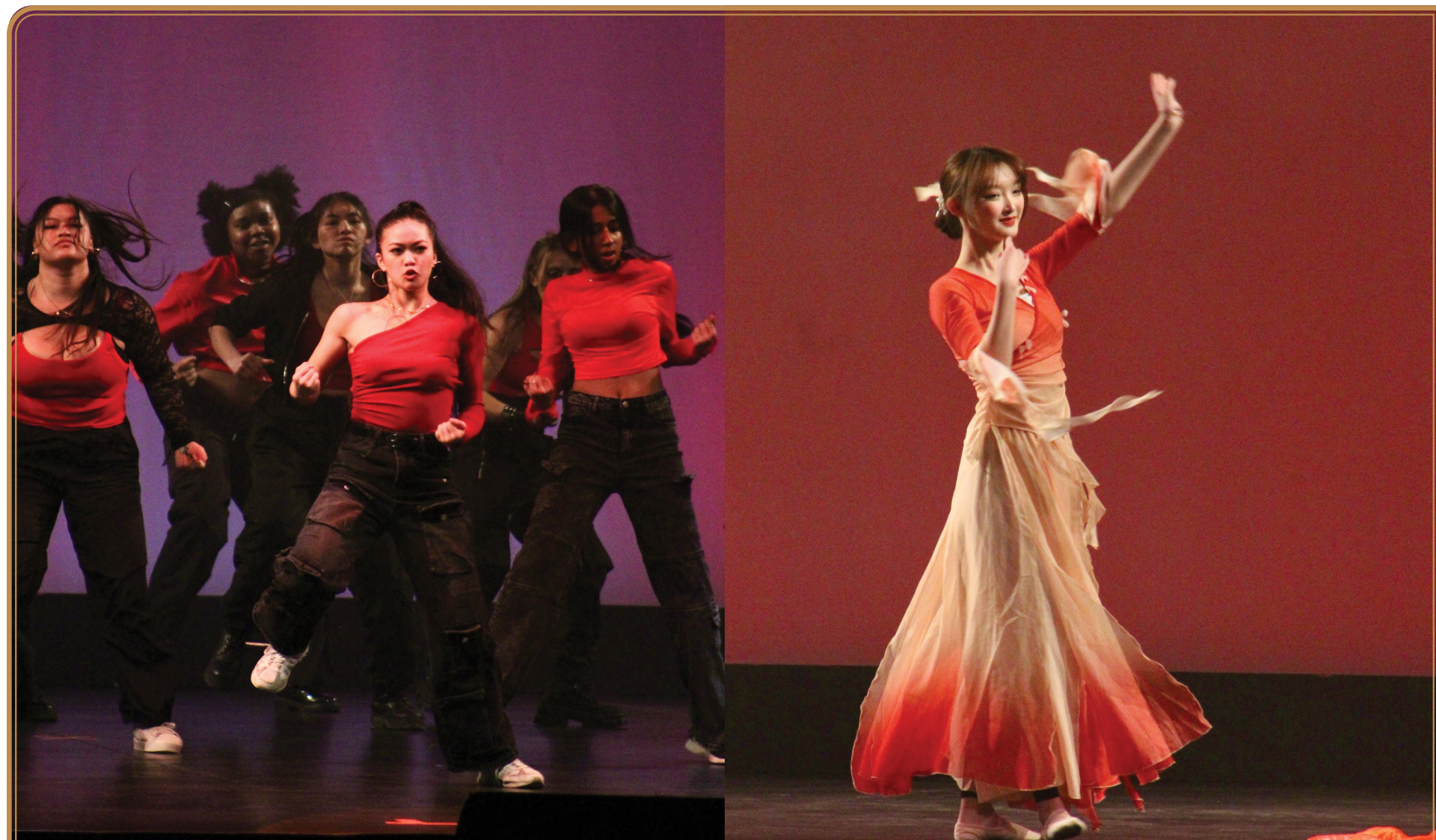
KConn performs during Asian Nite at the Jorgensen Center for the Performing Arts on Feb. 28, 2026. The talent show hosted by the Asian American Cultural Center featured multiple student groups and acts that showcased Pan-Asian cultures.