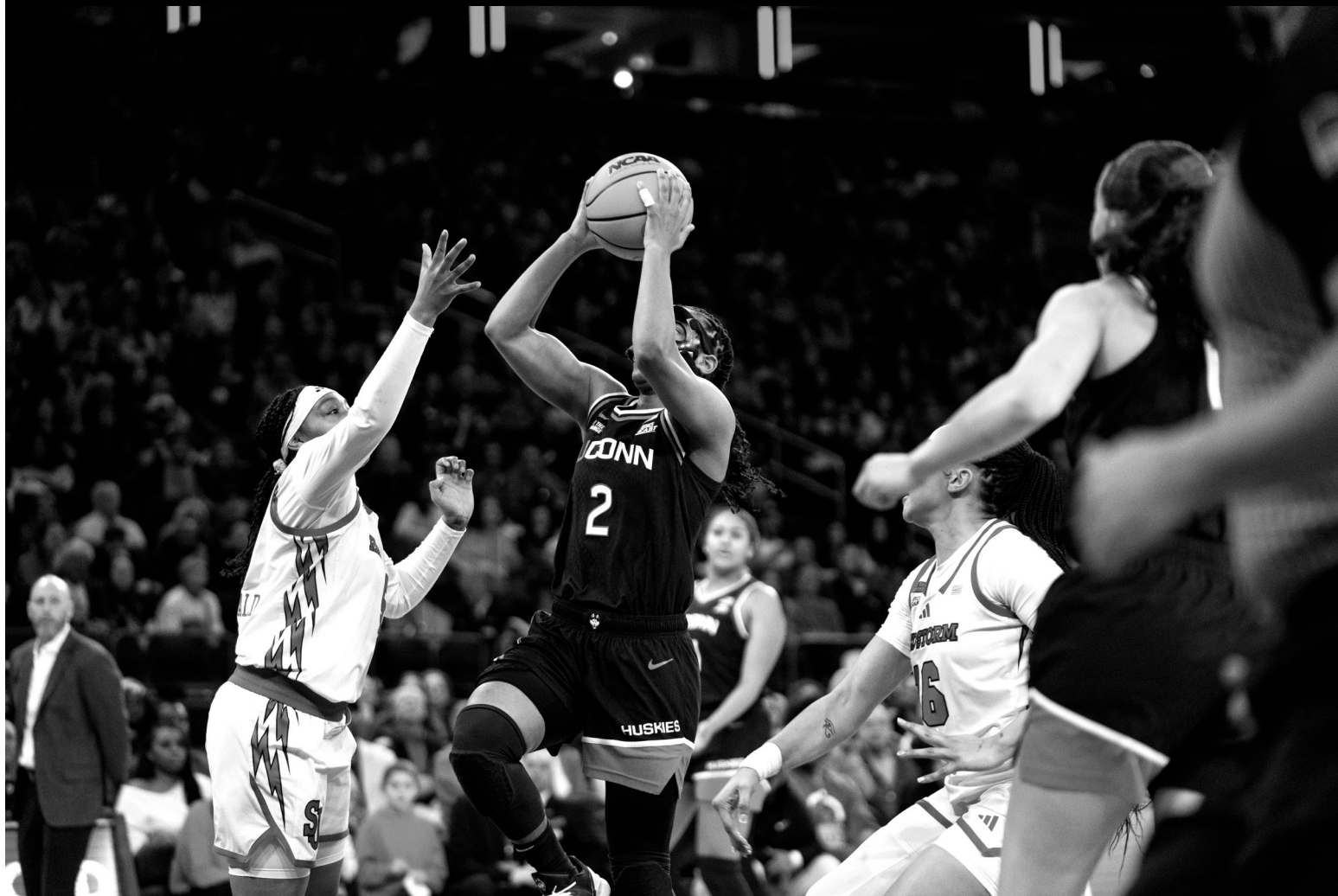
The Huskies play against the St. Johns Red Storm at Madison Square Garden in NYC, NY. The Huskies won with a final score of 85-49.