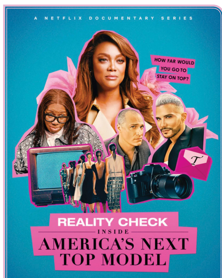
Promotional image for Netflix documentary series “America’s Next Top Model” starring Tyra Banks and former contestants. The docu-series was released Feb. 16, 2026 aiming to reflect on the harsh realities of the modeling industry in the early 2000s.

After rewatching this documentary a second time, I found myself pondering an important