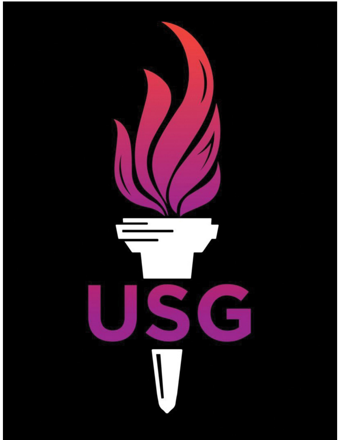
University of Connecticut’s Undergraduate Student Government (USG) logo. USG aims to voice and amplify student concerns to university administration.