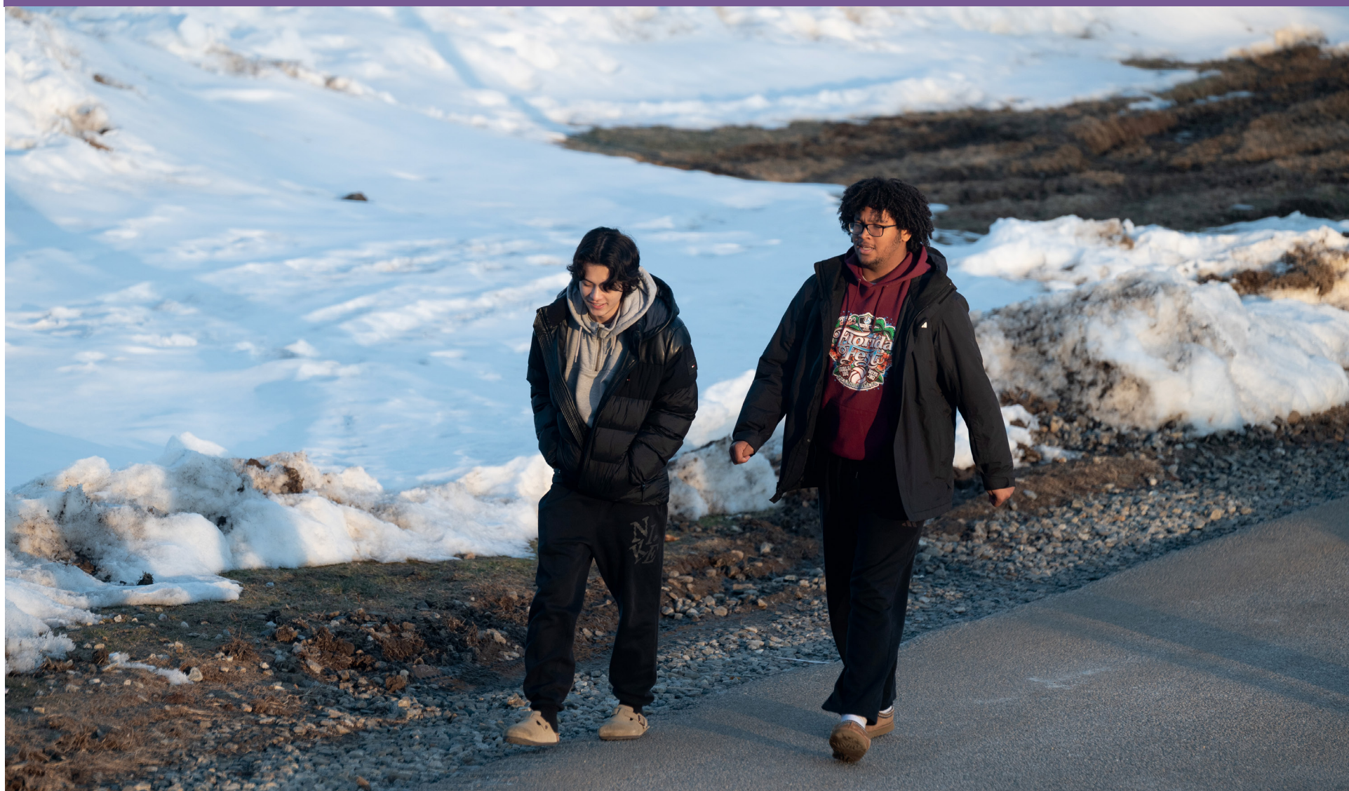
Two students walking to class on a cold day. Temperatures are slated to slowly rise through the rest of the week making the walks to classes more bearable.