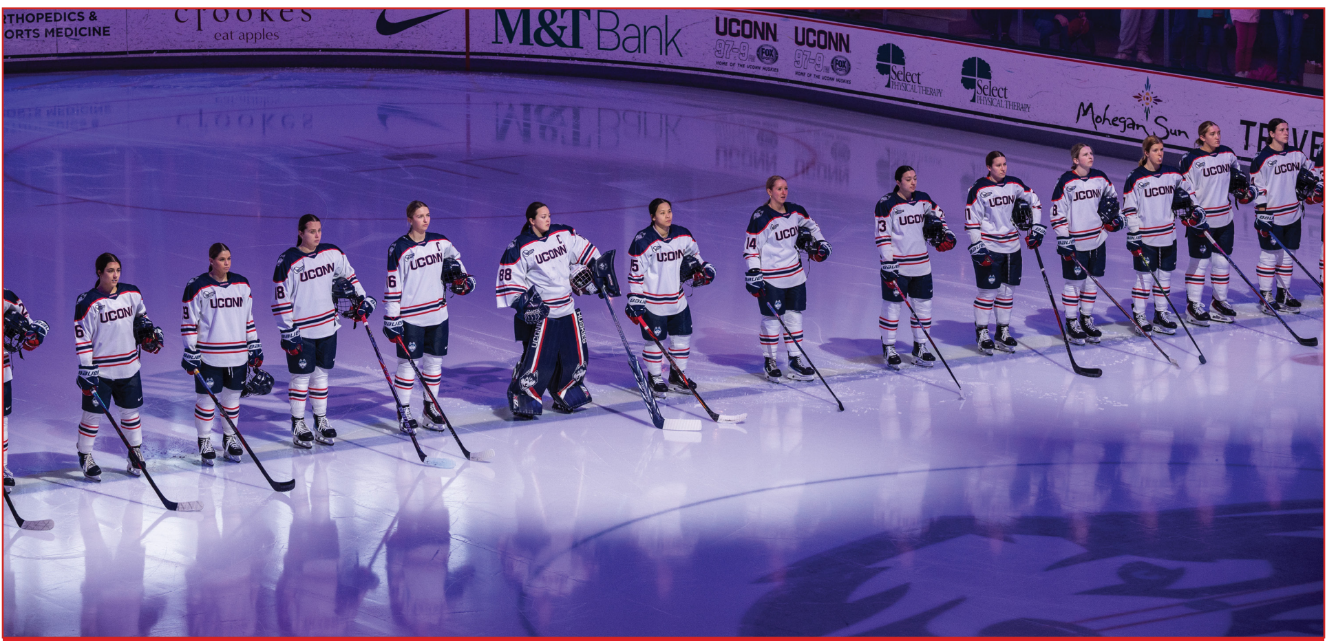
The UConn women's hockey team playing against Merrimack on Feb. 21, 2026. The Huskies won the shootout 5-3.