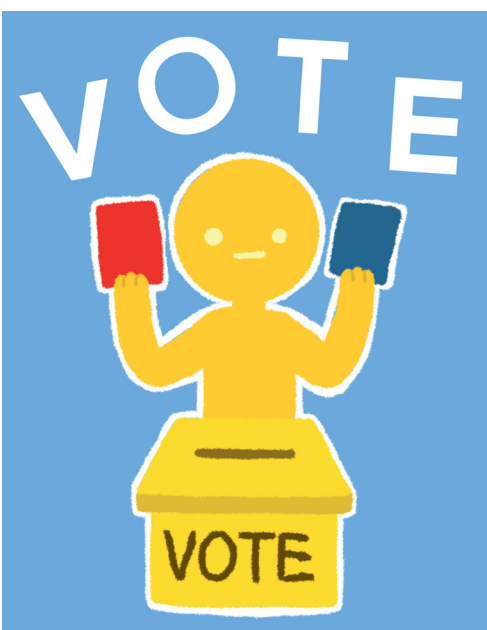
FILE ILLUSTRATION/THE DAILY CAMPUS

Voting for all UConn-related elections can easily be done online by clicking on the link at vote.uconn.edu . Elections are open to all fee-paying undergraduate students. From there, it's as simple as selecting candidates — don't miss the opportunity to make your voice heard!