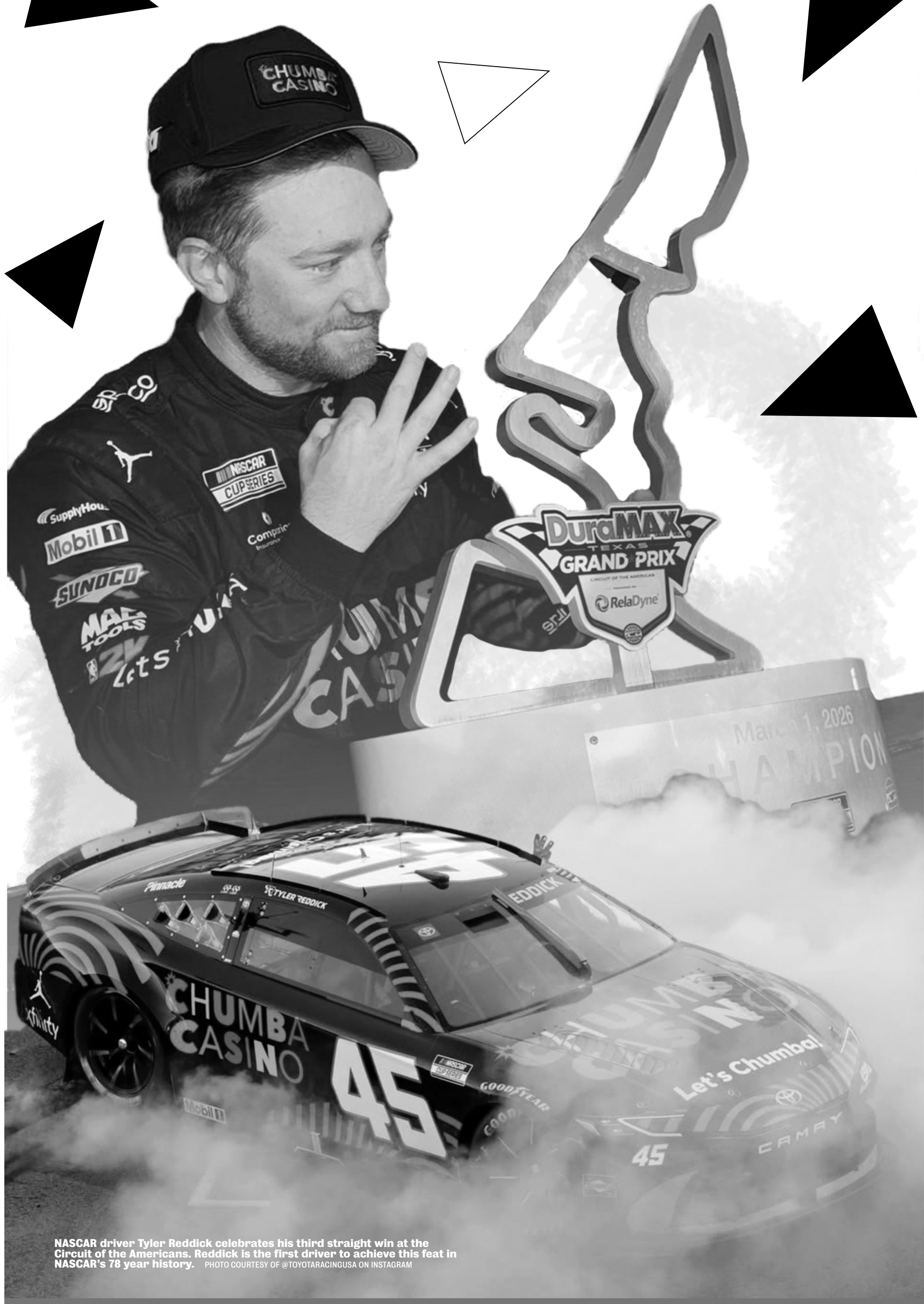
NASCAR driver Tyler Reddick celebrates his third straight win at the Circuit of the Americas. Reddick is the first driver to achieve this feat in NASCAR's 78 year history.