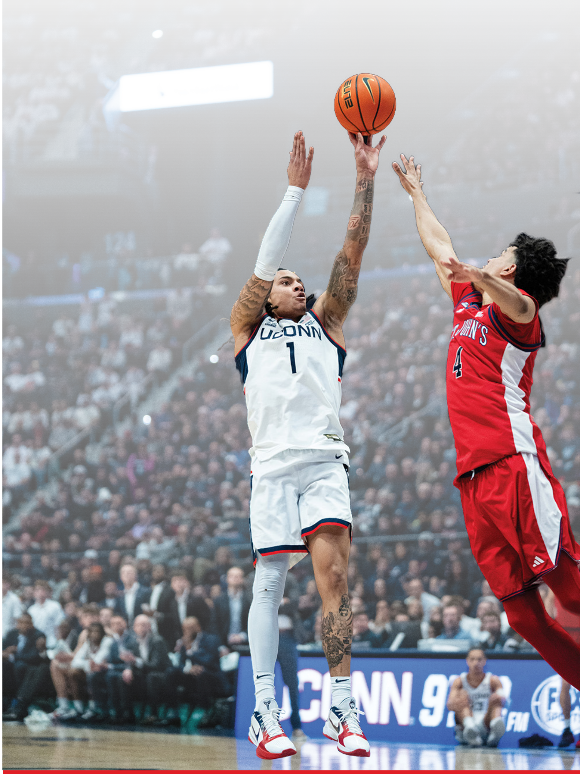
MBB vs St Johns February 25, 2026.

Six days after Seton Hall nearly upset UConn in Storrs, Conn., the Pirates celebrate Senior Day by welcoming St. John's from across the Hudson River. The Red Storm, assuming they beat Georgetown earlier in the week, will have a chance at a share of the Big East regular season title with a win in Newark, N.J. That has not been done since the Lou Carnesecca era. With a win, the Pirates could give Shaheen Holloway a better shot at Big East Coach of the Year. With their stifling defense, no team should want to see Seton Hall in March.