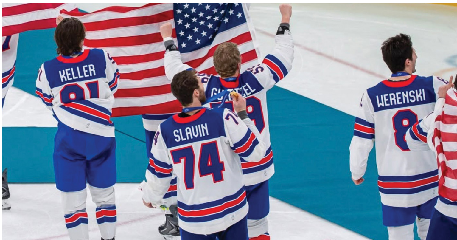
The USA men's hockey team celebrates their gold medal win at the 2026 Winter Olympics. The men's hockey team has come under fire due to its connections with the Trump administration.

The locker room video was posted on Monday night, and it took until Thursday for a player to acknowledge wrongdoing, with Swayman saying, "We should've reacted differently." The first apology would come hours later with Charlie McAvoy saying he's "Certainly sorry for how we responded to it in that moment." How come it took four days for an apology? Instead, we got the Hughes Brothers doing various interviews stating how they previously hung out with the women's team, which somehow absolves them of all public backlash? If the majority of the players had