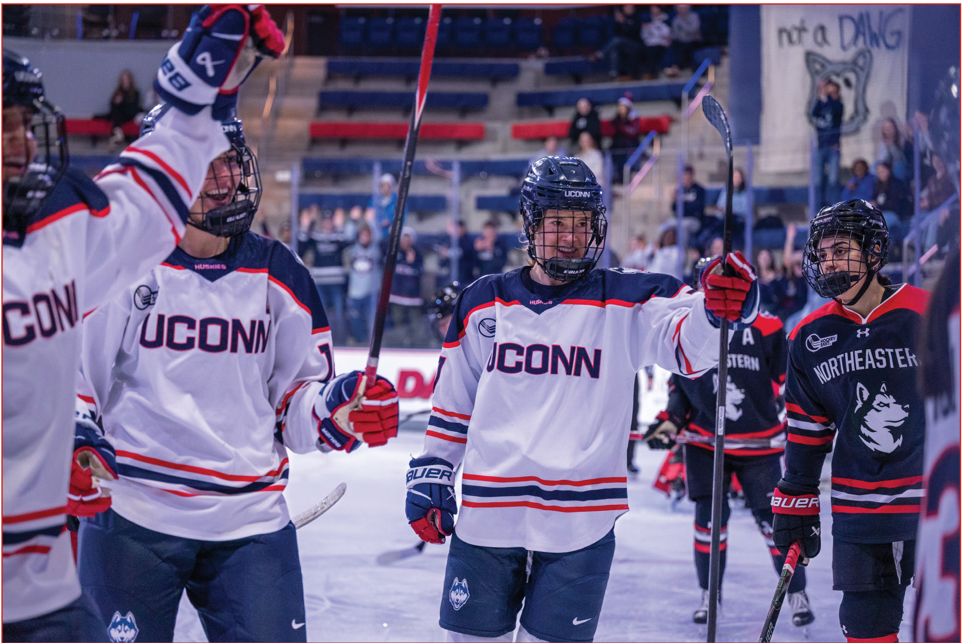
UConn women's hockey team takes on Northeastern at the Toscano Family Ice Forum on Friday, February 20. UConn was defeated 3-2 in overtime.

Puck drop is scheduled for 6 p.m. at the Toscano Family Ice Forum. The game will stream live on ESPN+.