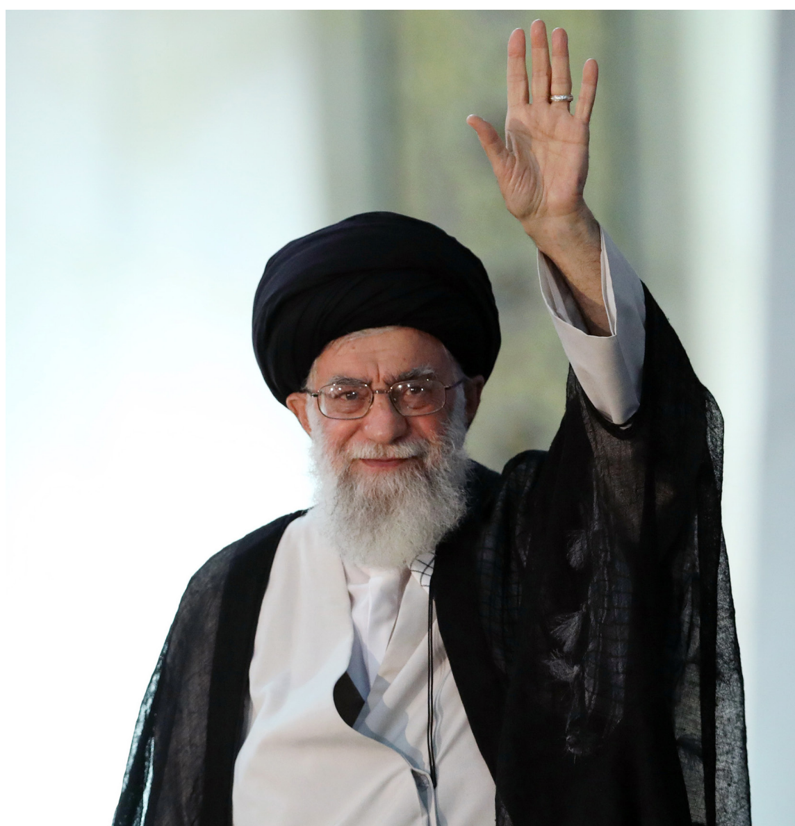
Iranian supreme Leader Ayatollah Ali Khamenei. Ali Khamenei died on Sat. Feb. 28 after collective airstrikes from Israel and the United States on his Tehran compound.

The Israeli Air Force has responded by carrying out a new wave of strikes on the Iranian capital Tehran, according to the Israeli Defense Forces (IDF). Iran has been launching waves of strikes in the Middle East