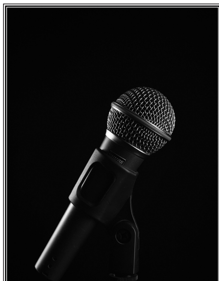
Close up of a microphone on a stand. Sunday, Mar. 1, the University of Connecticut Music Department held a recital titled “Her Voice, Her Story.”

The final song, “My Favorite Things,” is a tune featured in “The Sound of Music,” a well-