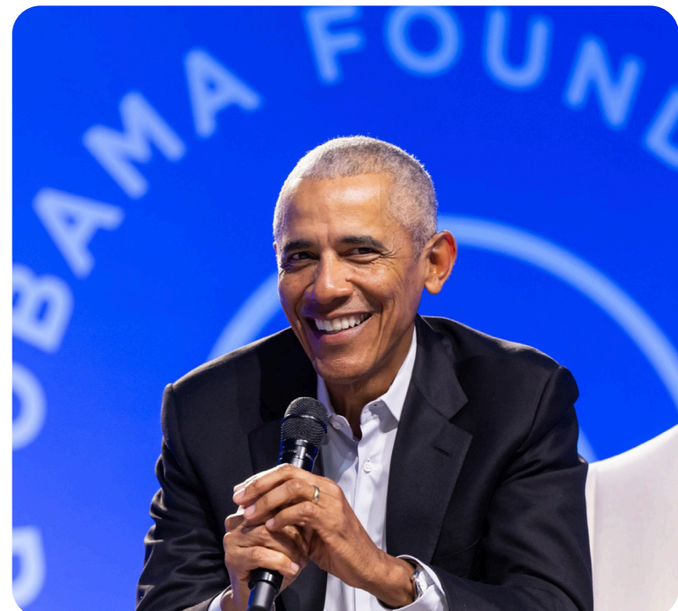
44th President of the United States, Barack Obama. Obama is the founder and creator of the Obama Foundation, which he founded over 12 years ago.

Nostalgia, like mentioned before, is one of those things that is always going to exist for each generation; what's important to realize is that the past is not the perfect place that we remember it to be. In fact, it is the events of the past that lead to the developments of the present time. It is easy to view the "stomp, clap, hey" indie music and the funny trends of the time and believe nothing was wrong, but you need to remember that when we look to the past it is often through rose-tinted glasses. It does not mean you can't yearn for anything, in fact, that can be positive. But remember that the world we live in now is created from what has happened in the past. So, instead of looking longingly behind you, look forward.